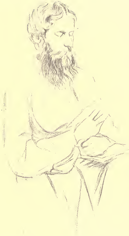
Sir. Rabindranath. Tagore