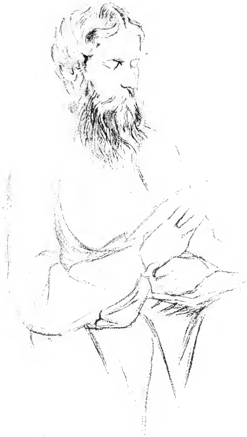
Sir. Rabindranath Tagore Formal Drawing by W. Rothstein