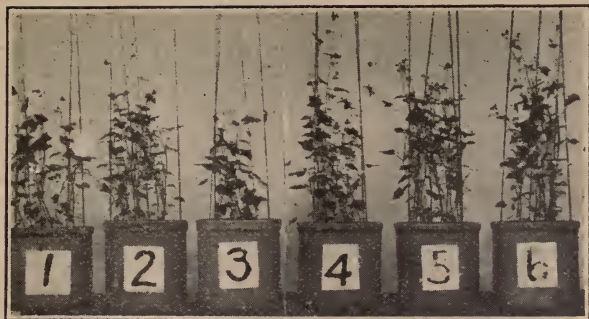
BUCKWHEAT PLANTS GROWING ON PEAT SOIL TO WHICH VARIOUS SHALE MATERIALS HAVE BEEN ADDED