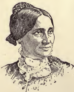
Mrs. U. S. Grant.