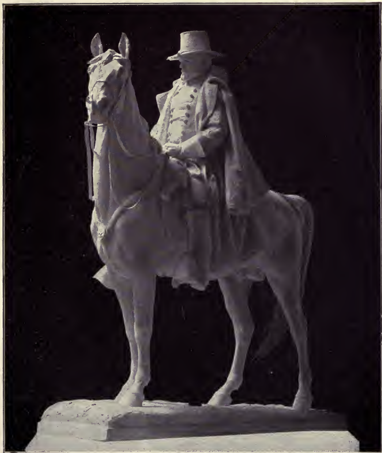
EQUESTRIAN STATUE OF GENERAL GRANT WHICH IS TO BE THE CENTRAL FIGURE OF THE GRANT MONUMENT NOW BEING ERECTED AT THE FOOT OF CAPITOL HILL, WASHINGTON, D. C.

Photograph of the model, Henry Merwin Shrady, Sculptor