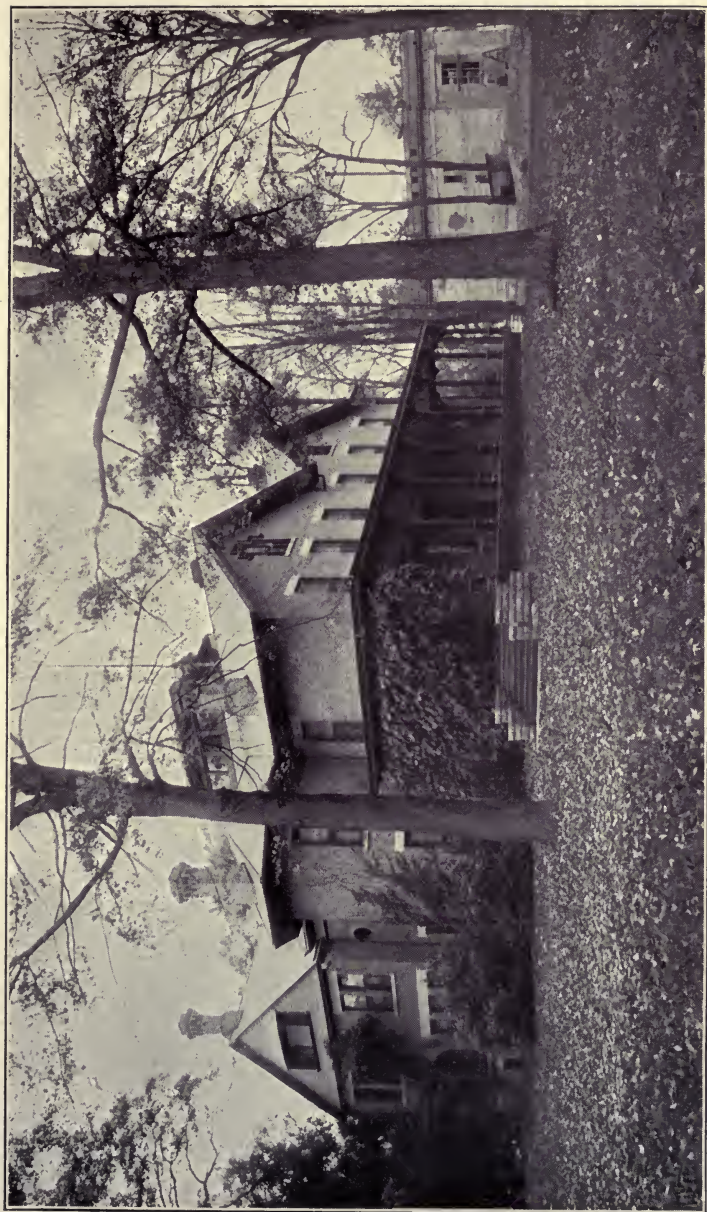
SPIEGEL GROVE, FREMONT, OHIO, THE HOME OF RUTHERFORD B. HAYES.