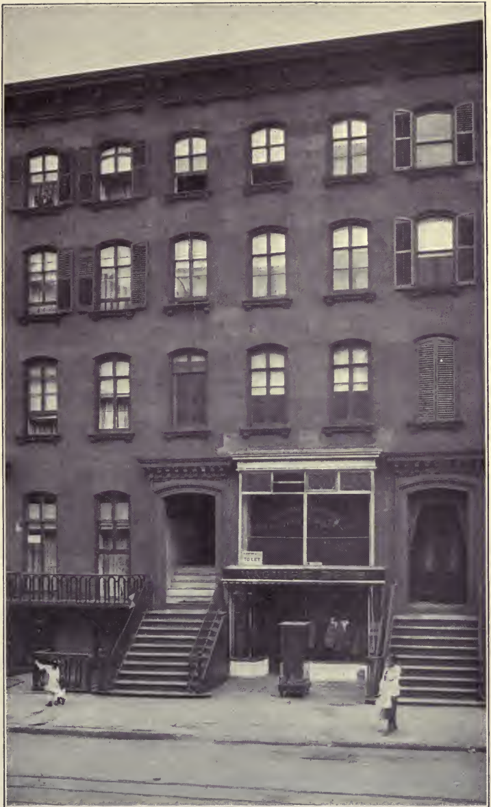
HOME OF CHESTER A. ARTHUR, 123 LEXINGTON AVENUE, N. Y. CITY, AS IT APPEARS TO-DAY. HERE MR. ARTHUR TOOK THE OATH AS PRESIDENT, SEPTEMBER 20, 1881, AND DIED NOVEMBER 18, 1886