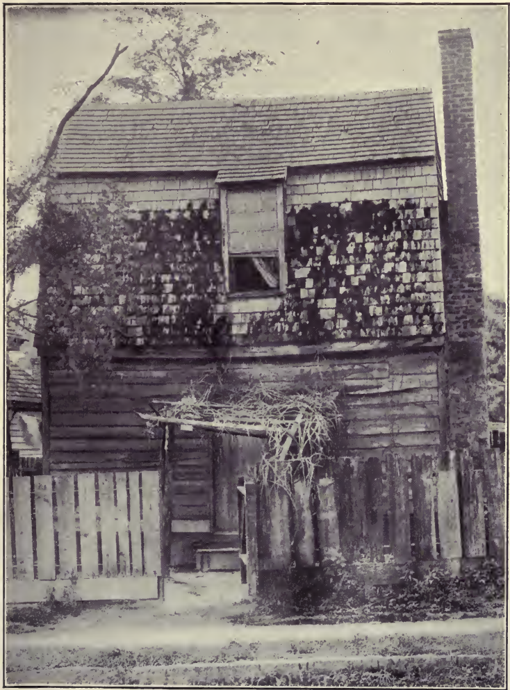
BIRTHPLACE OF ANDREW JOHNSON, RALEIGH, N. C.

UNIVERSITY OF NORTH CAROLINA AT CHAPEL HILL