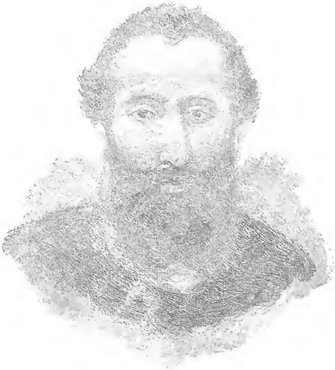
JOHN THE BAPTIST.