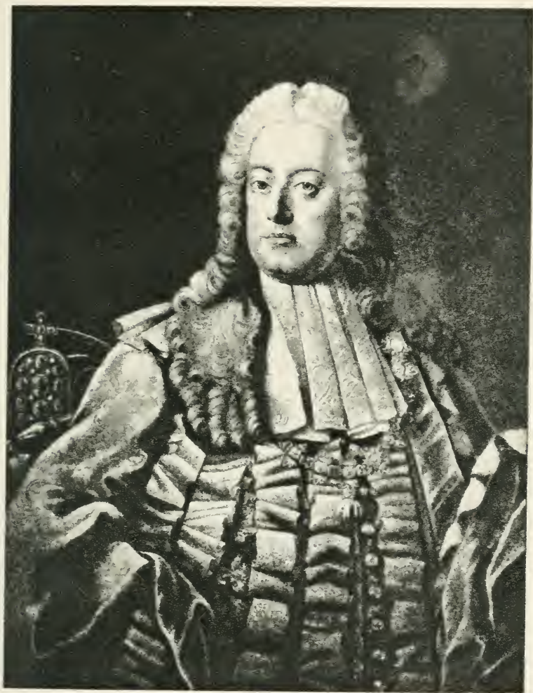
Francis I Emperor of Germany