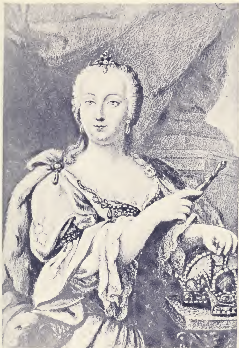
Maria Theresa, Empress of Austria and Germany