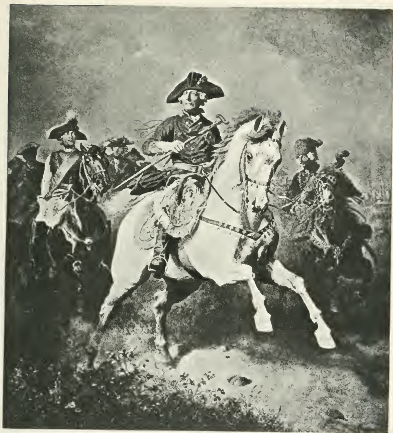
Frederick the Great