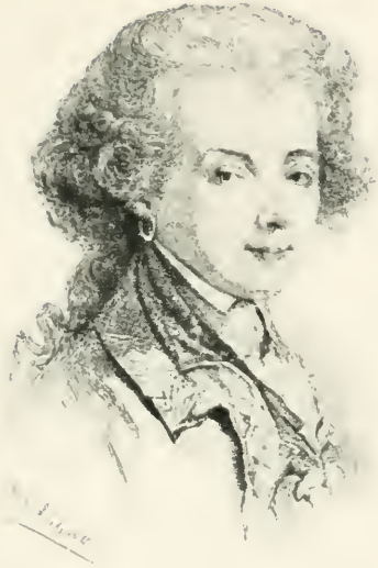
The Prince de Ligne