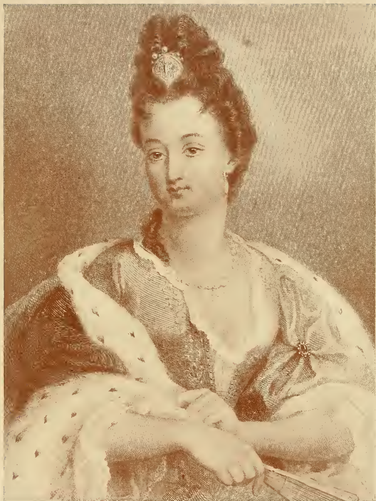
DUCHESS DU MAINE After the portrait by Staal