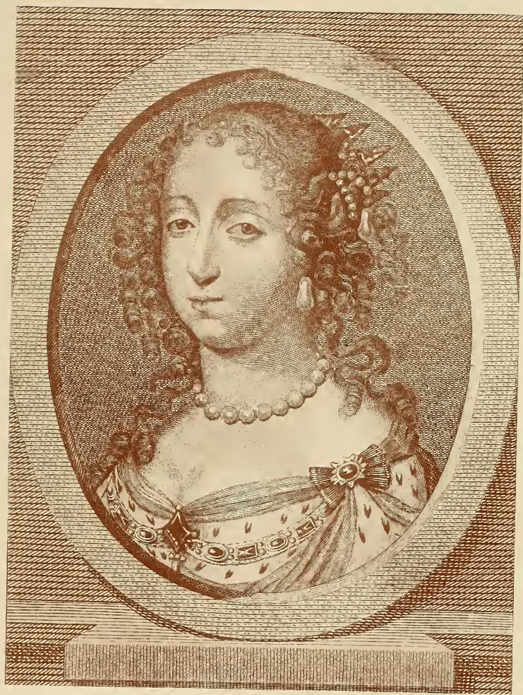
QUEEN ELEONORA OF SWEDEN From an old copper print