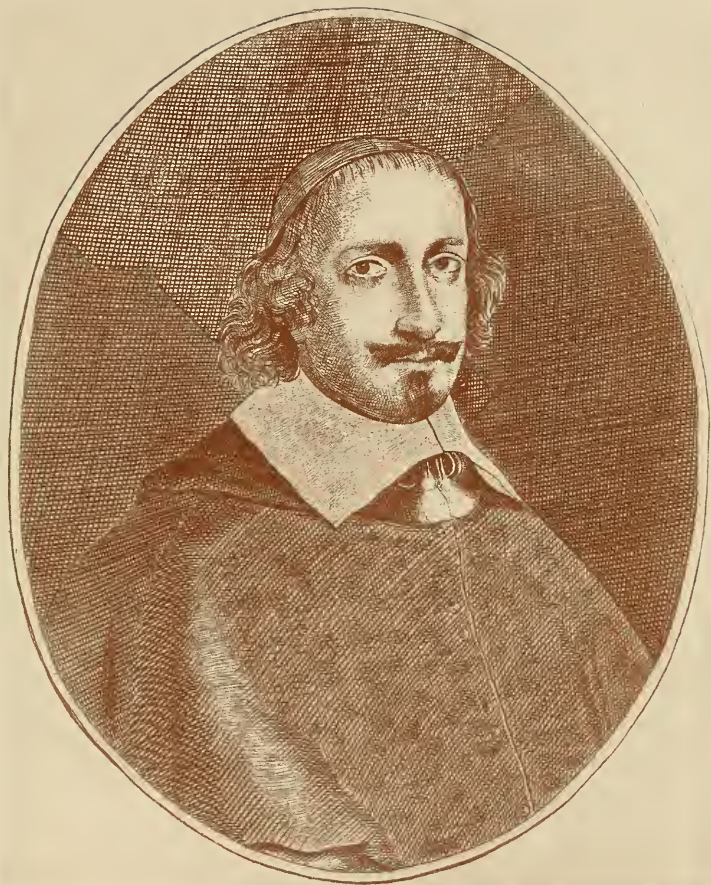
CARDINAL MAZARIN From the portrait by R. Gaywood