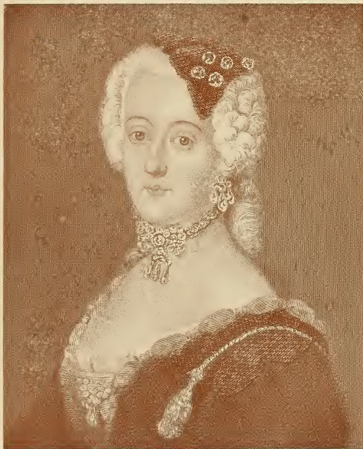
THE MARGRAVINE OF BAYREUTH From a steel engraving