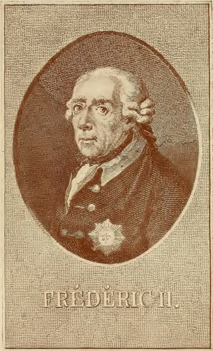
FREDERICK THE GREAT From an old copper print