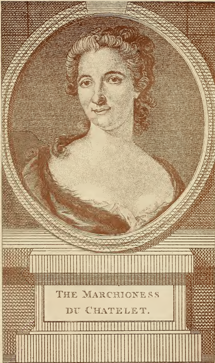
MARCHIONESS DU CHÂTELET From an old copper print