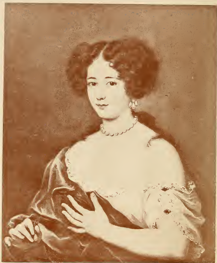
MARIE MANCINI From the painting by Mignard