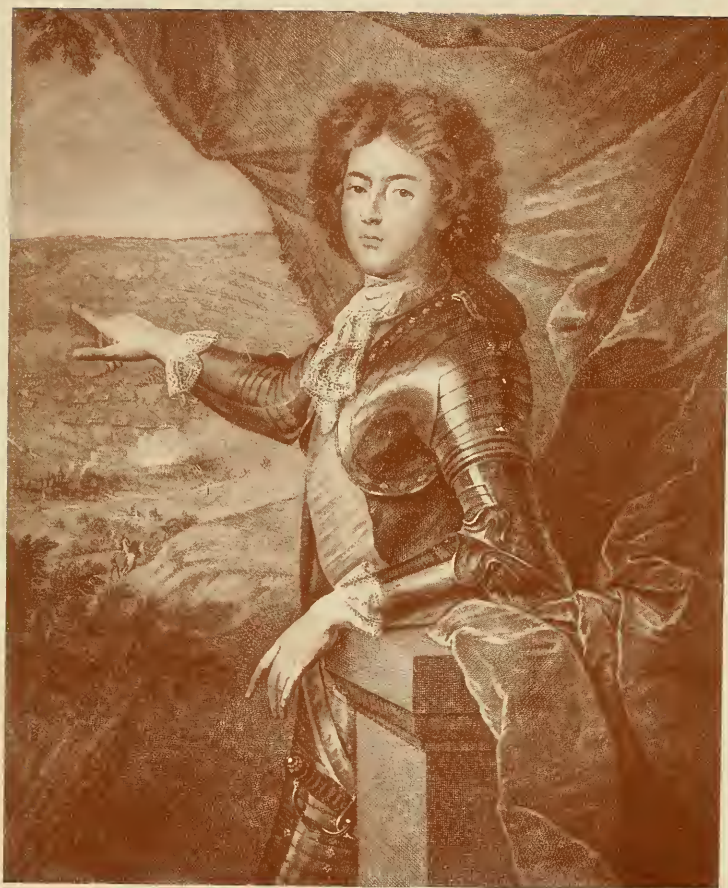
DUC DU MAINE From an old copper print