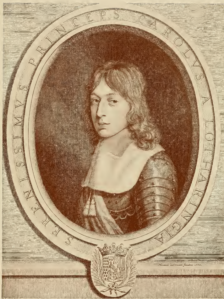
PRINCE CHARLES OF LORRAINE From an old copper print