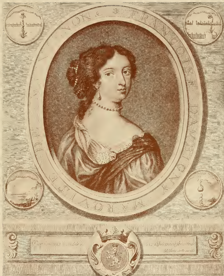
MADAME DE MAINTENON