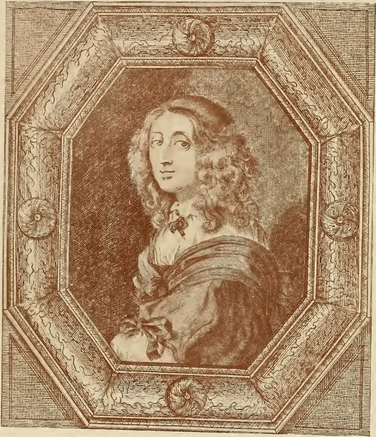
QUEEN CHRISTINA OF SWEDEN From an old copper print