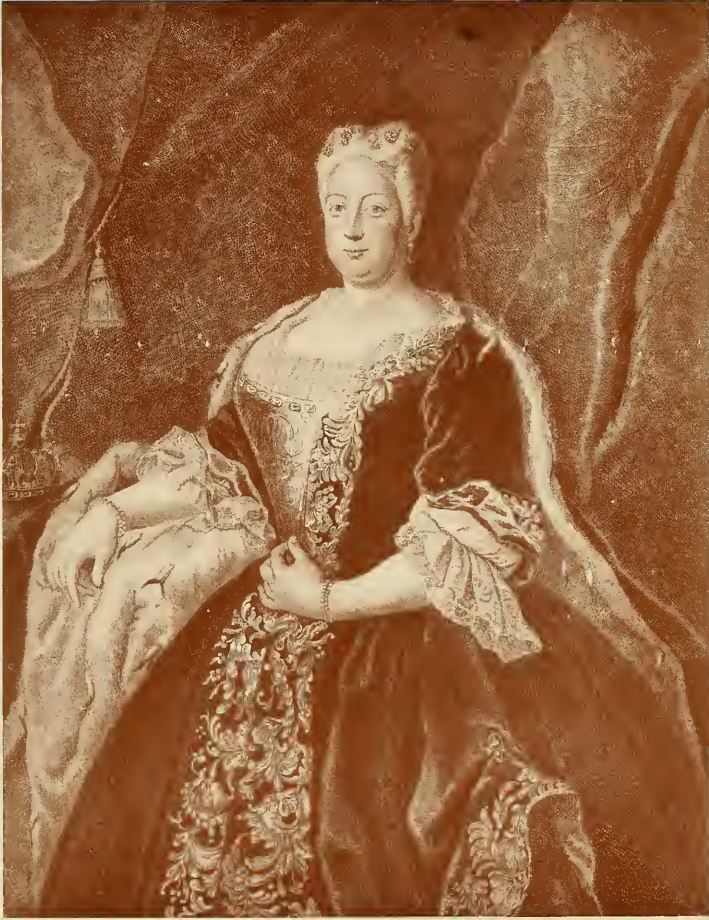
SOPHIA DOROTHEA QUEEN OF PRUSSIA From an old copper print