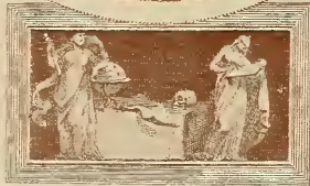
RENÉ DESCARTES