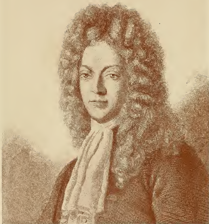
NICOLAS DE MALEZIEU From an old copper print