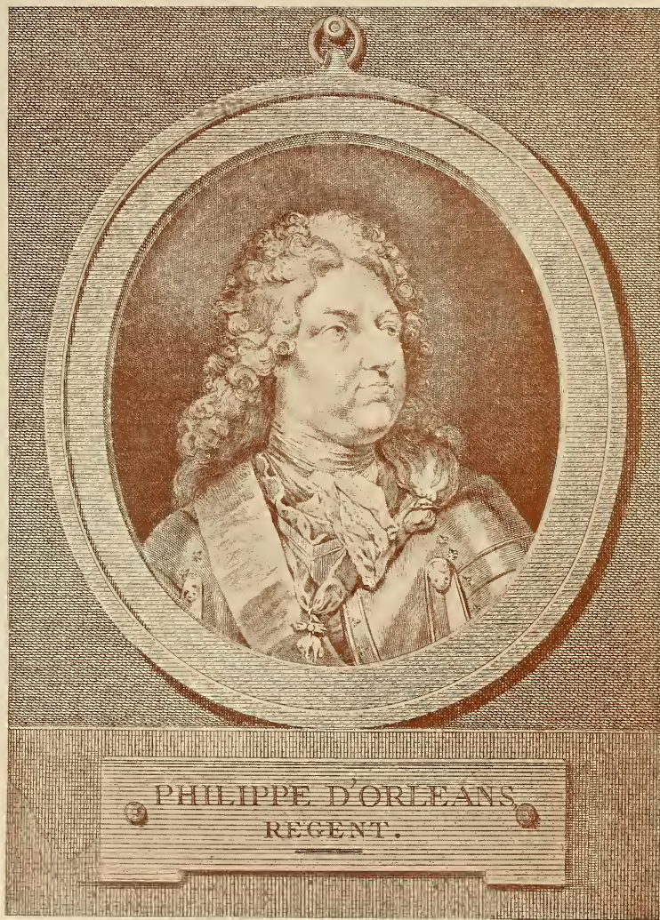
PHILIPPE DUC D'ORLÉANS From an old copper print