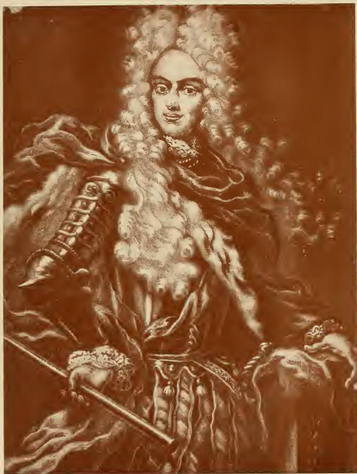
AUGUSTUS THE STRONG, KING OF POLAND From an old print