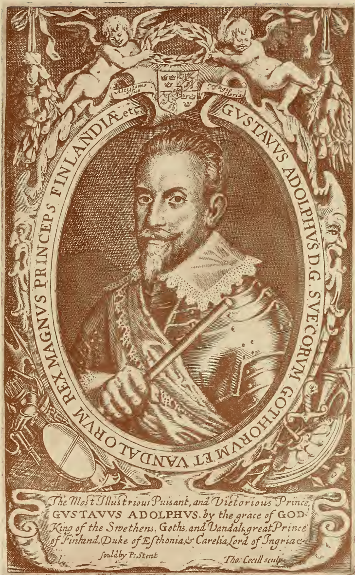
GUSTAVUS ADOLPHUS From an old copper print