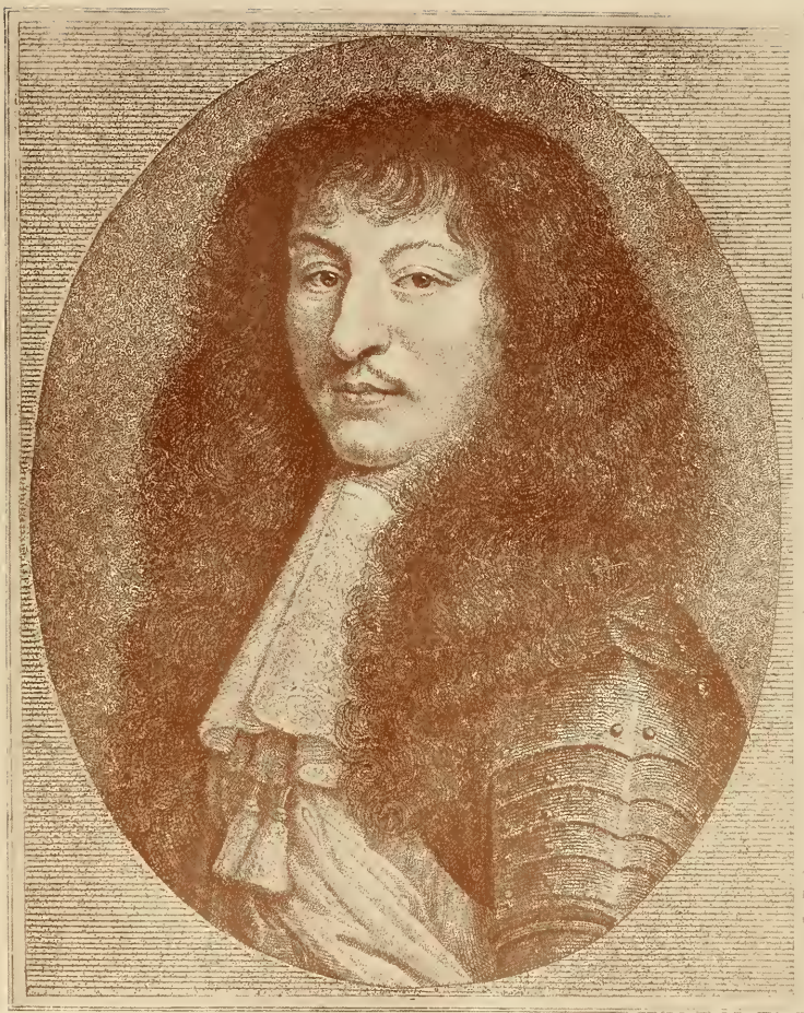
LOUIS XIV After a print by Nanteuil