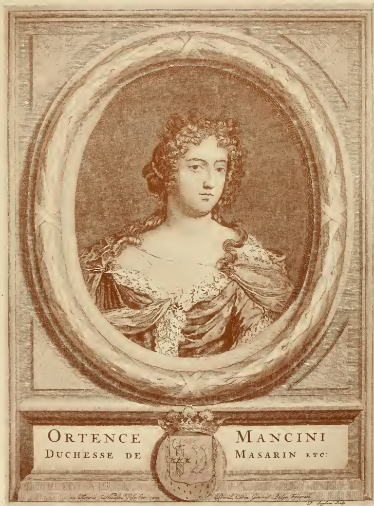
HORTENSE MANCINI From an old copper print