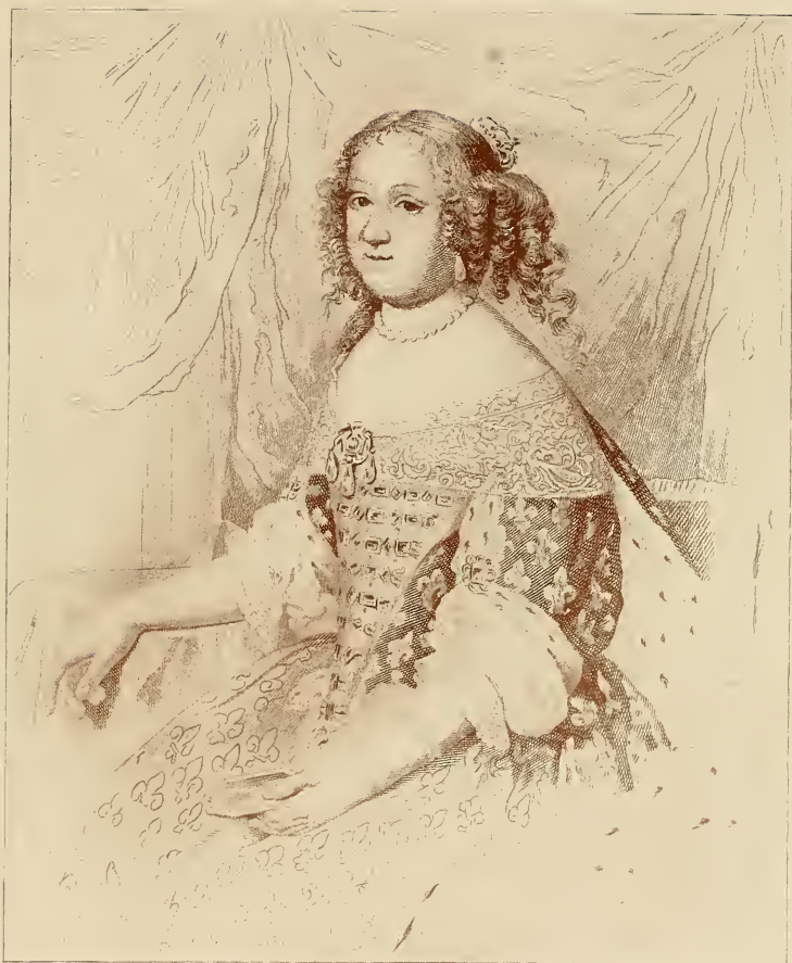
MARIA THERESA From an old copper engraving