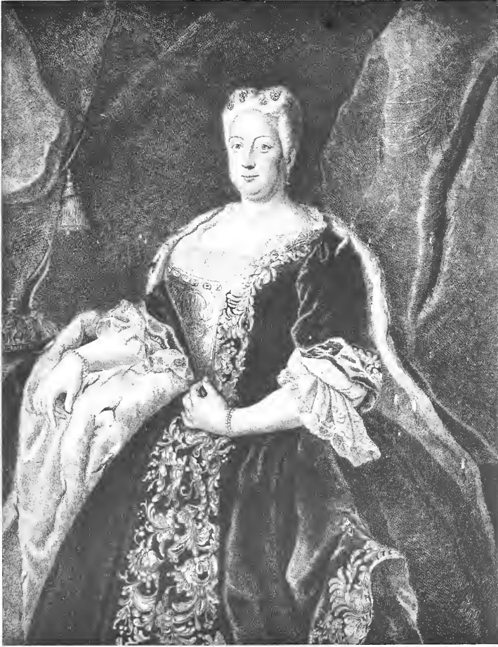
SOPHIA DOROTHEA QUEEN OF PRUSSIA From an old copper print