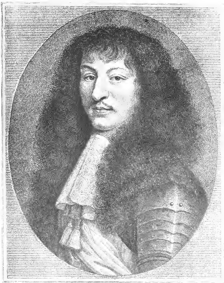
LOUIS XIV After a print by Nanteuil