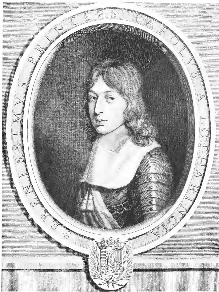
PRINCE CHARLES OF LORRAINE From an old copper print