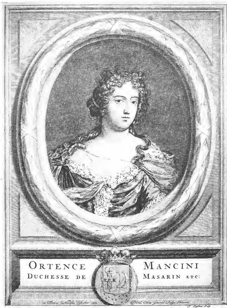
HORTENSE MANCINI From an old copper print