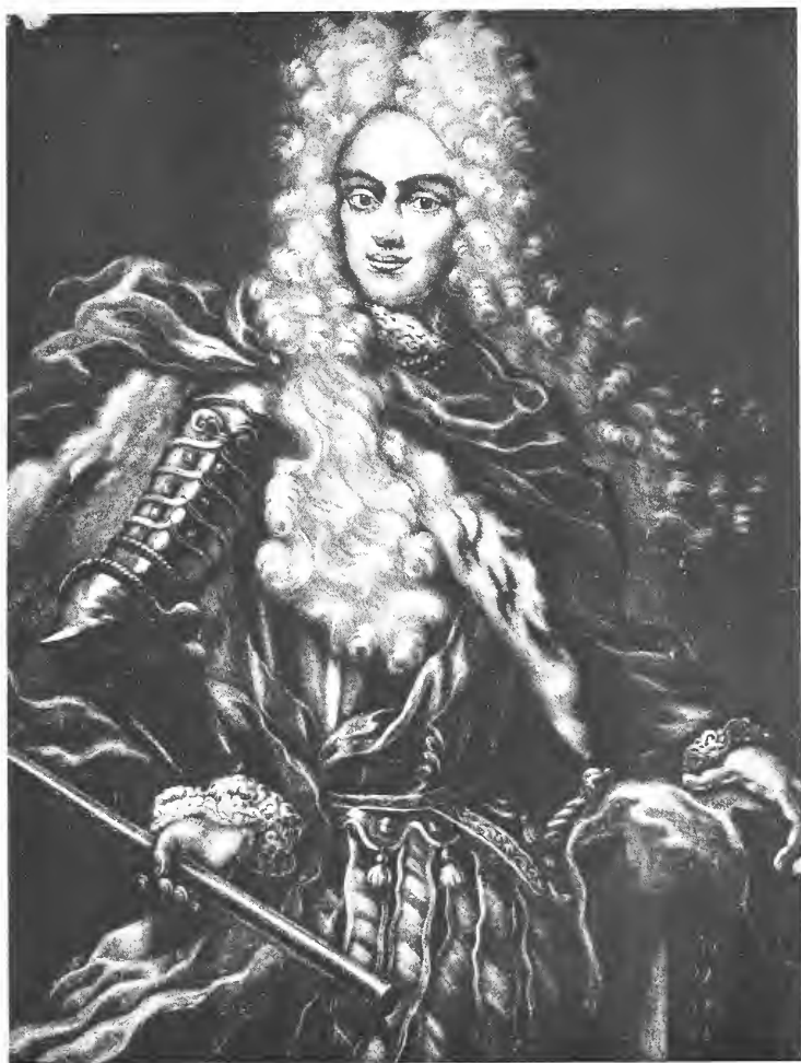
AUGUSTUS THE STRONG, KING OF POLAND From an old print