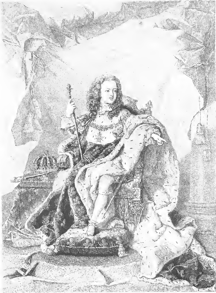
LOUIS XV. After the painting by Hyacinthe Rigaud