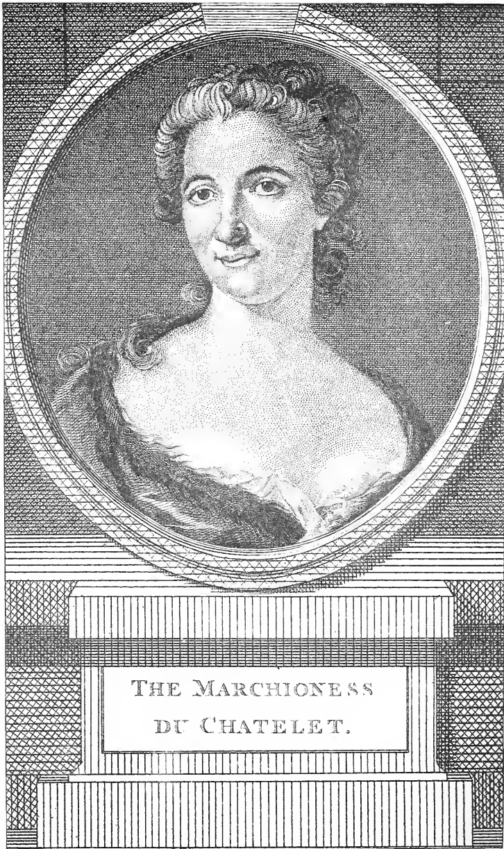
THE MARCHIONESS DU CHATELET.