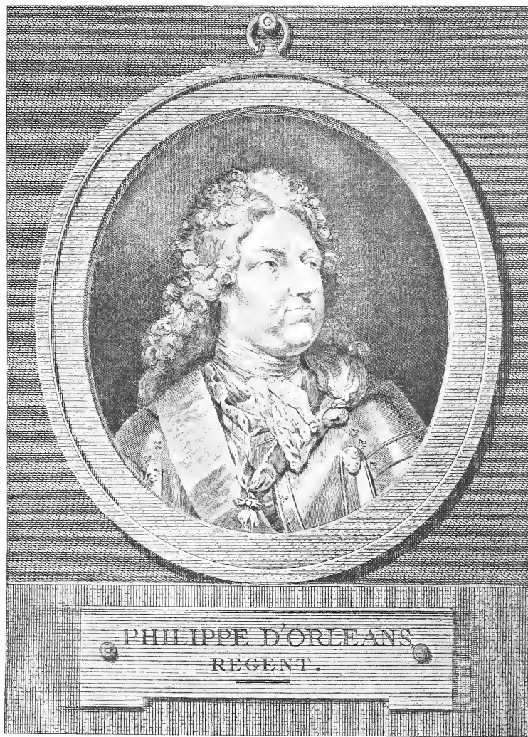
PHILIPPE DUC D'ORLÉANS From an old copper print