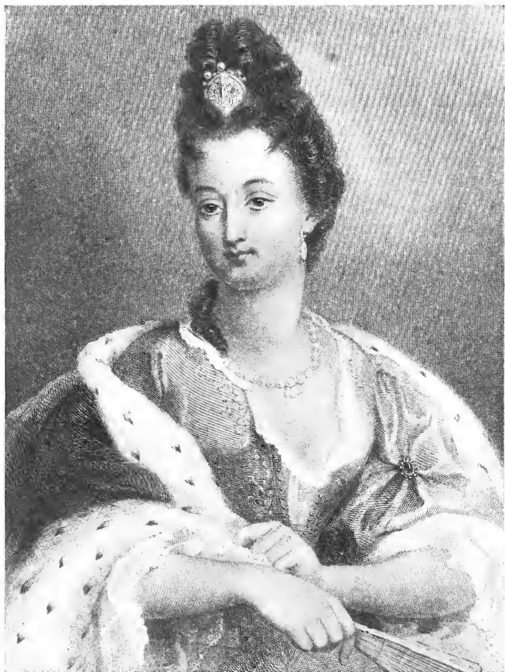
DUCHESS DU MAINE After the portrait by Staal