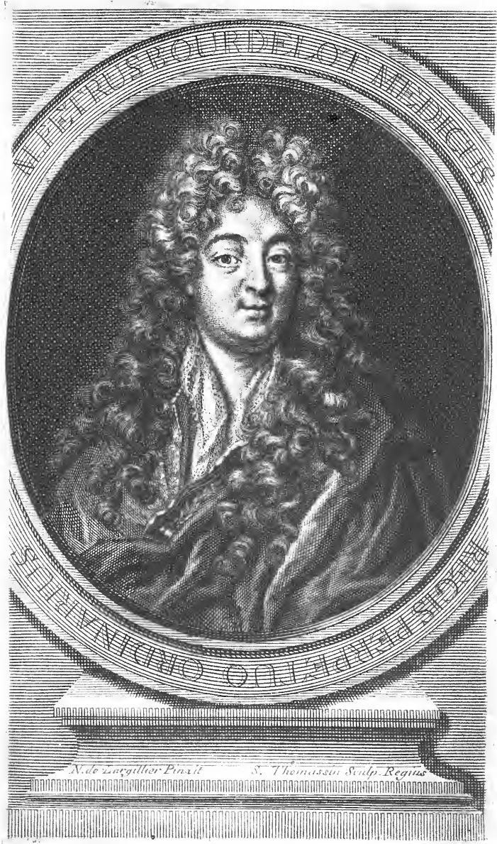
ABBÉ BOURCELOT After the painting by N. de Largillier