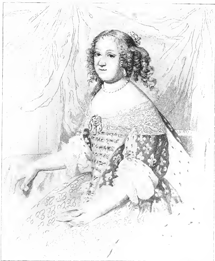
MARIA THERESA From an old copper engraving