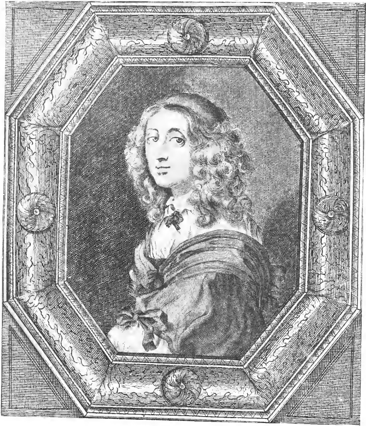
QUEEN CHRISTINA OF SWEDEN From an old copper print