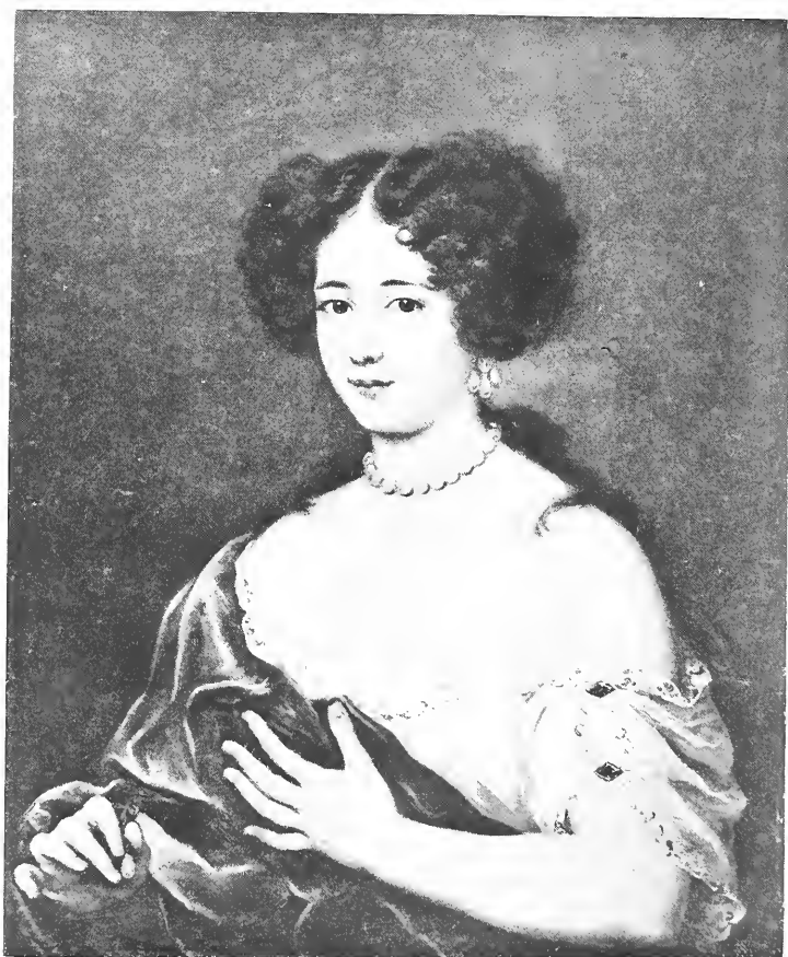
MARIE MANCINI From the painting by Mignard