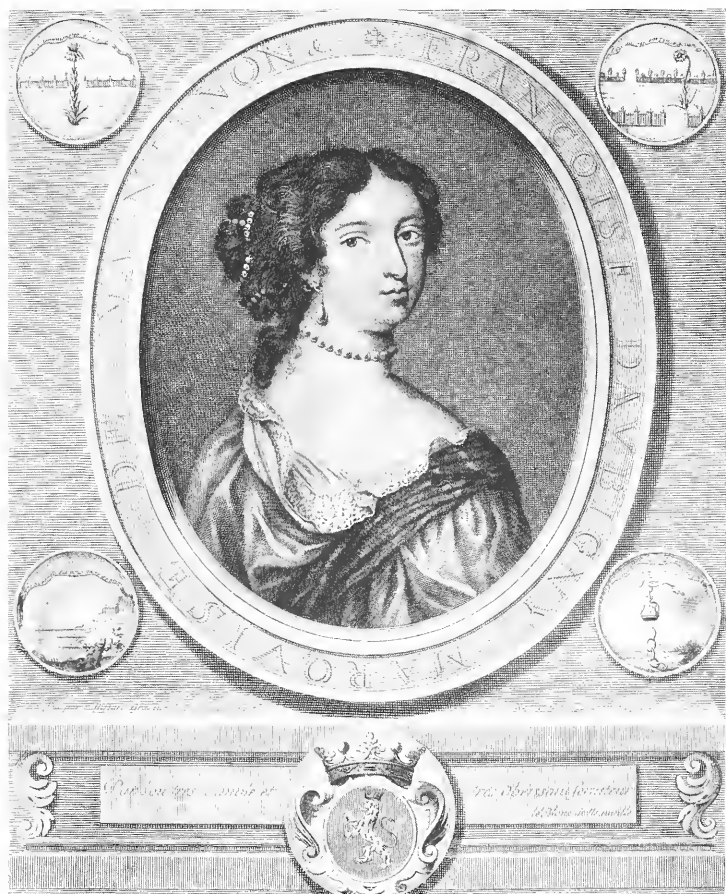
MADAME DE MAINTENON From the engraving by P. Giffart