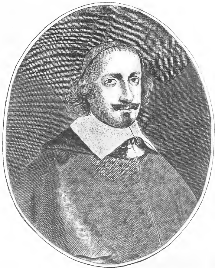
CARDINAL MAZARIN