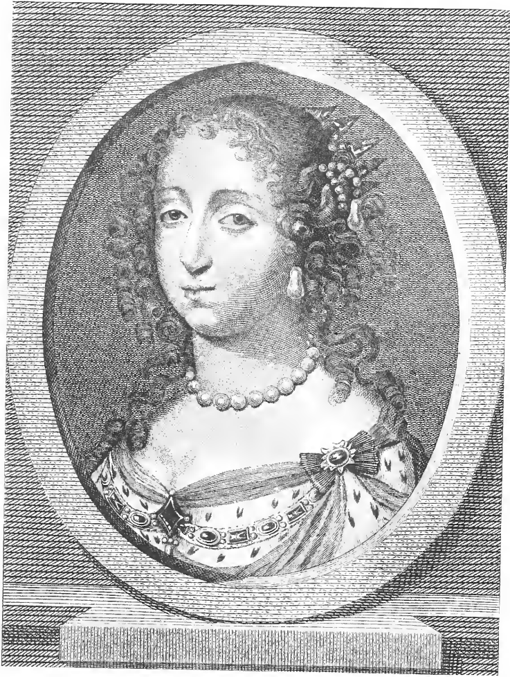
QUEEN ELEONORA OF SWEDEN From an old copper print