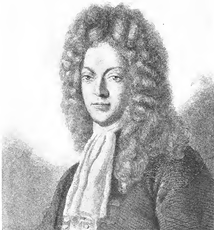
NICOLAS DE MALEZIEU From an old copper print