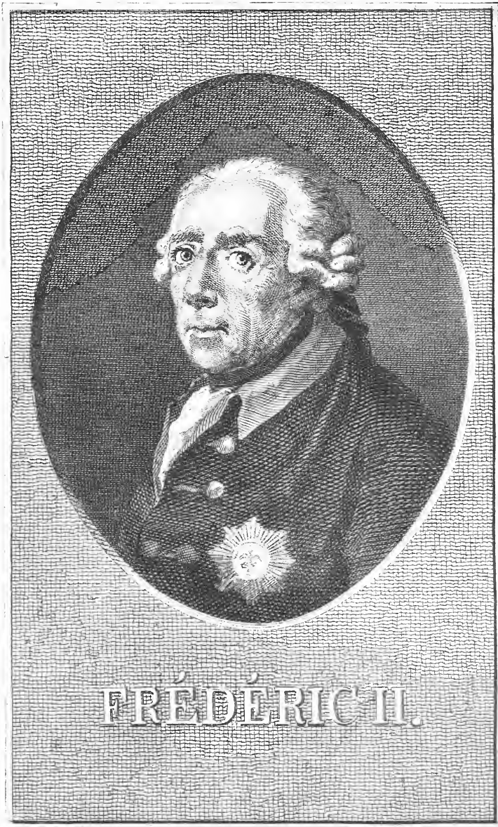
FREDERICK THE GREAT From an old copper print