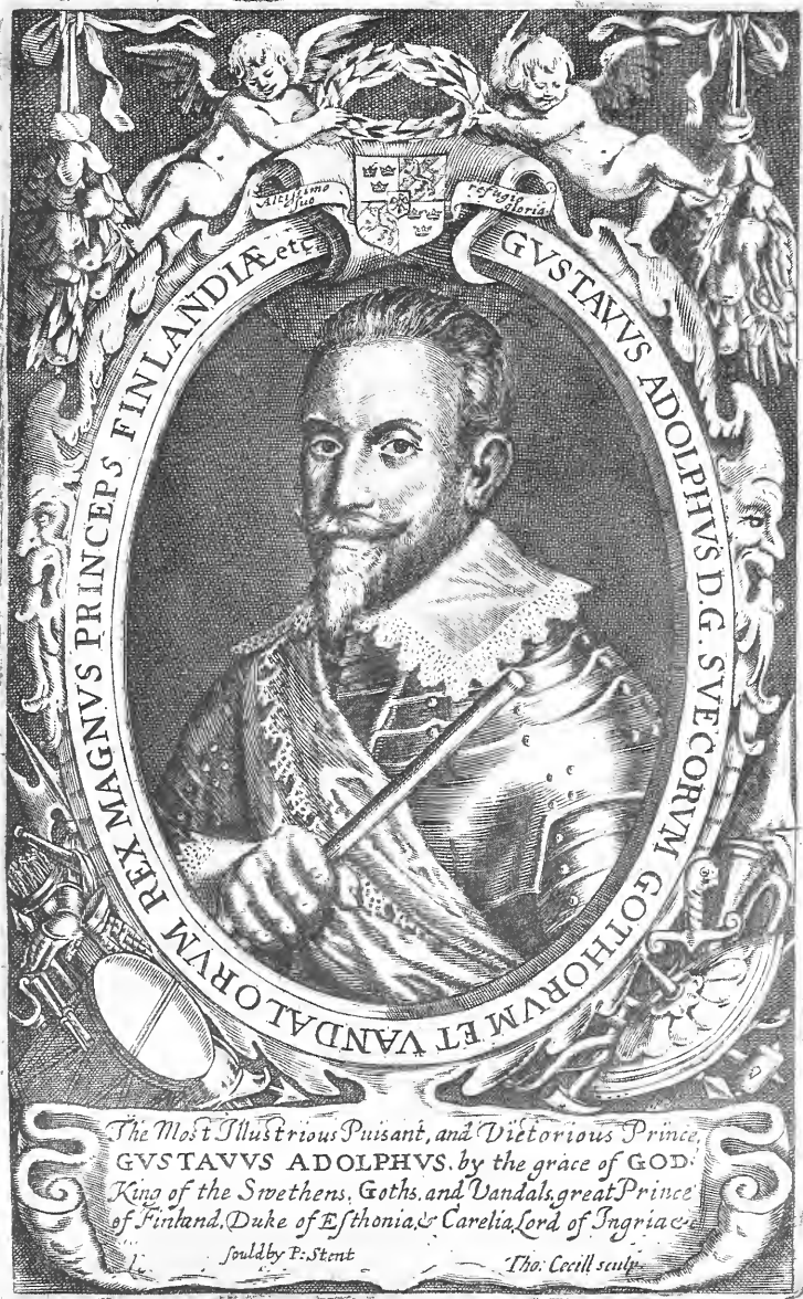
GUSTAVUS ADOLPHUS From an old copper print