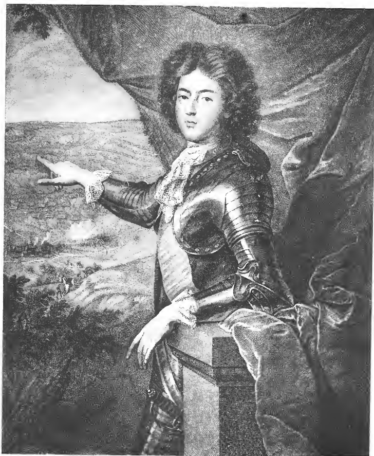
DUC DU MAINE From an old copper print