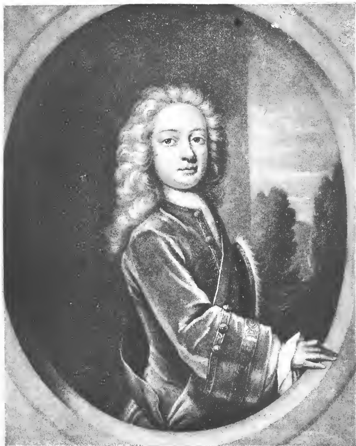
FREDERICK, DUKE OF GLOUCESTER From the painting by I. Simon