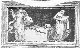
RENÉ DESCARTES