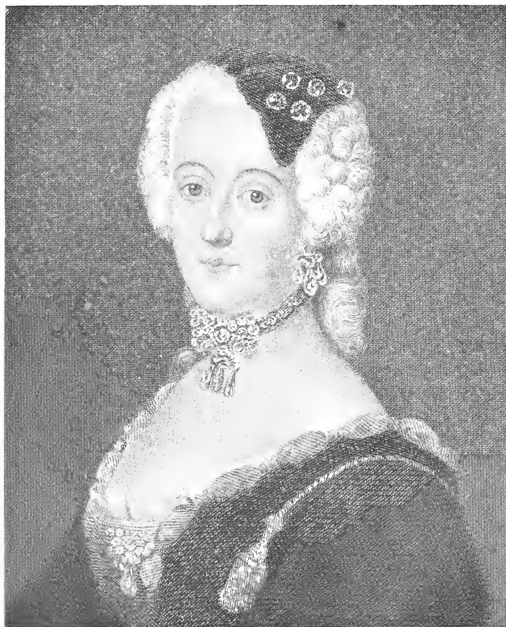
THE MARGRAVINE OF BAYREUTH From a steel engraving