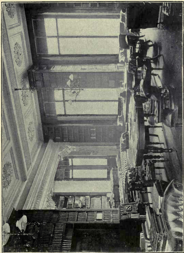
Library, ROYAL COLONIAL INSTITUTE, NORTHUMBERLAND AVENUE.