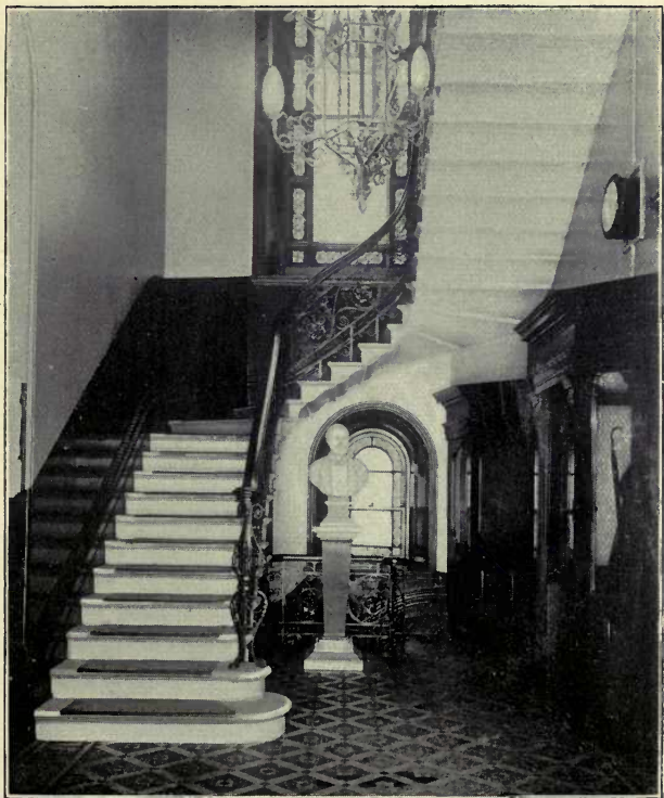
Entrance Hall, ROYAL COLONIAL INSTITUTE, NORTHUMBERLAND AVENUE.