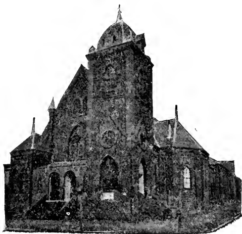
Tabernacle Baptist Church Raleigh

RALEIGH PRESSES OF EDWARDS & BROUGHTON 1905