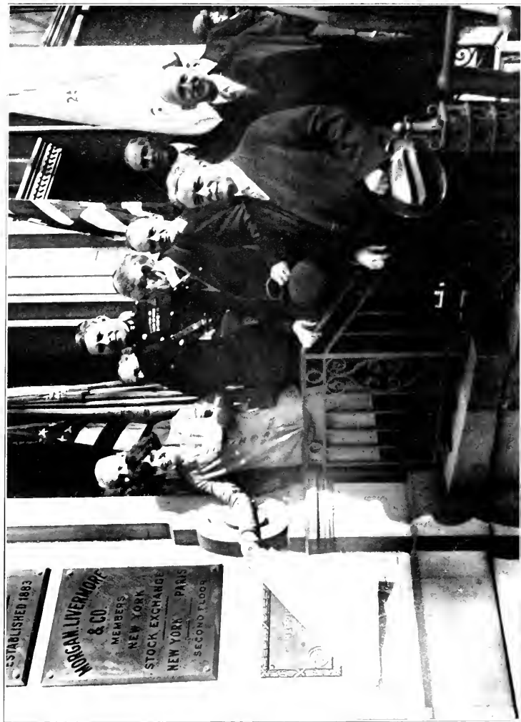
WASHINGTON, D. C., APRIL 19, 1923.