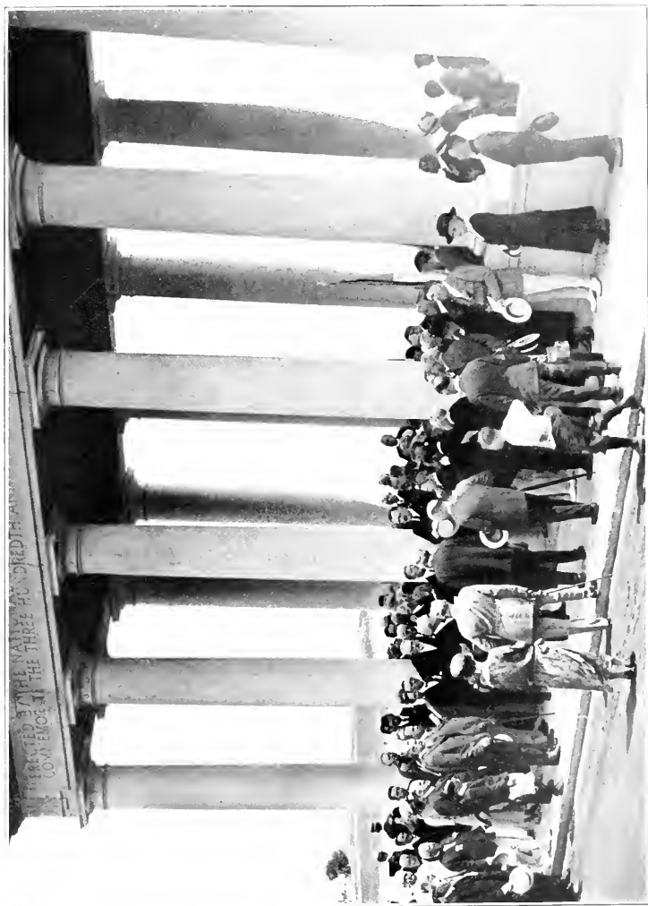
TRIENNIAL MEETING, PLYMOUTH ROCK