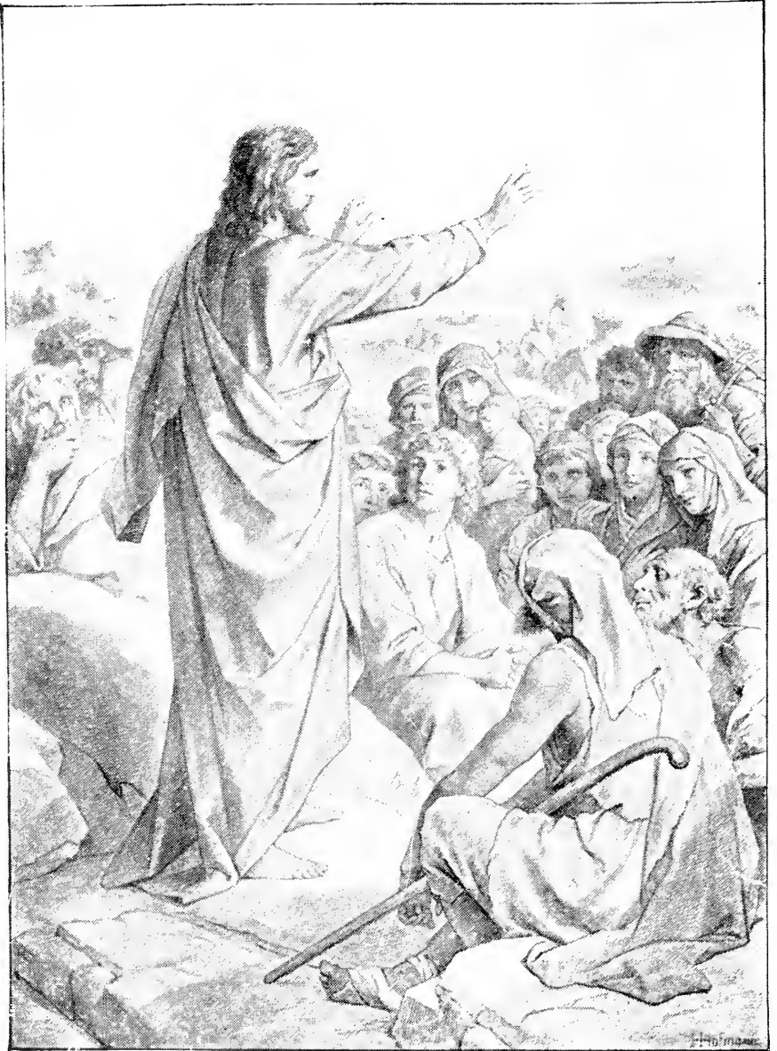
JESUS, THE TEACHER OF MANKIND.