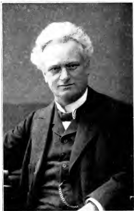
CARL HEINRICH CORNILL.