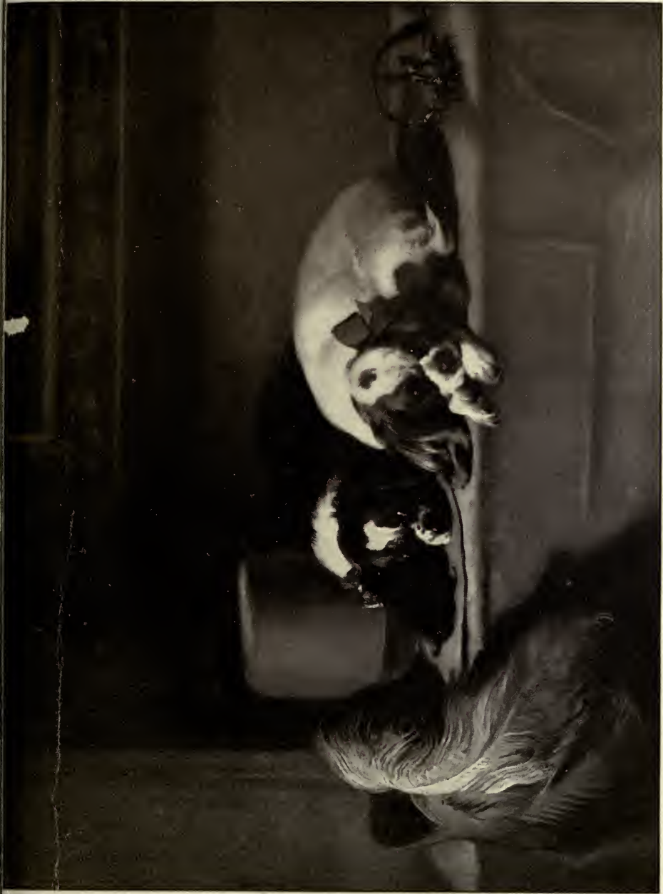
THE PERRY PICTURES, 898, DOSTON EDITION.