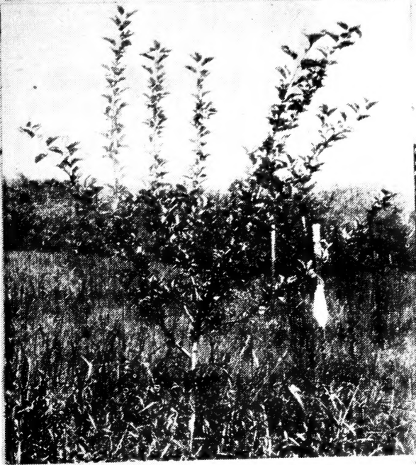
A. Chemical deer repellents, like asafetida, are placed in bags similar to that here shown on an apple tree in a Granville, Mass., orchard.