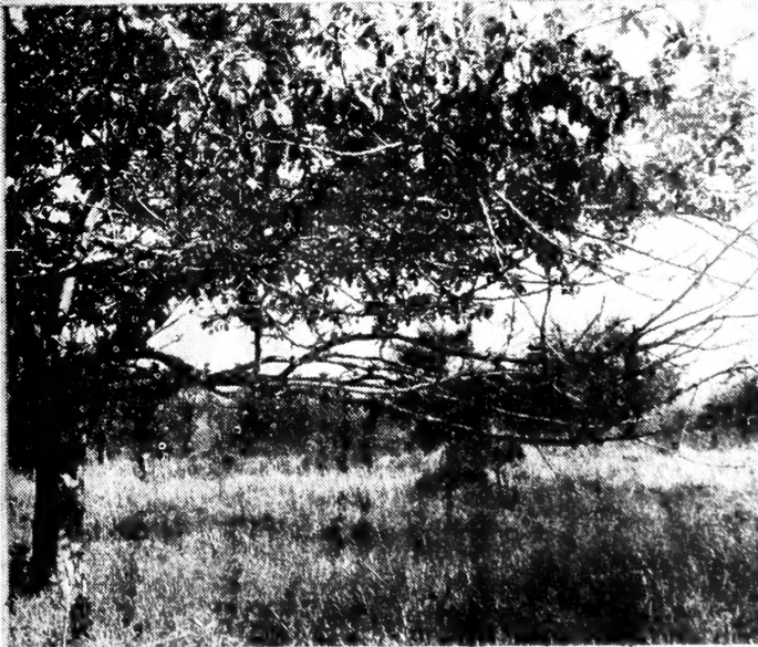
D. Young apple tree almost completely defoliated by deer that browsed in Mount Alto State Forest, Pa.