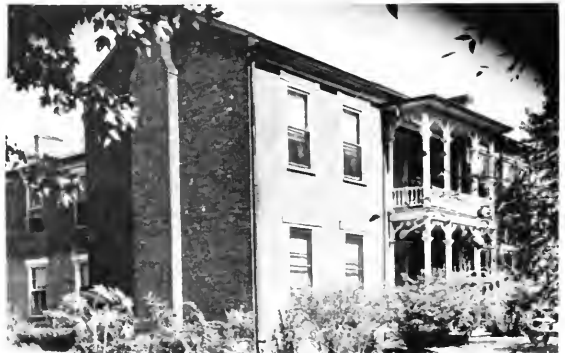
BAPTIST FEMALE INSTITUTE

school houses and educating the children of the poor and destitute, would not only be a wiser course of reasoning, but the whole people should be educated, and your argument can never stop until it results from ignorance every and the lowest individuals whose voice may be heard in the affairs of the country. A few well-versed and intelligent men can very easily deceive and enslave an ignorant people, and rule over them with a rod of iron. But it is not in the power of many wise and intelligent men to save a people from destruction who possess the power and wealth of a nation and yet grope in the midnight darkness of ignorance. To this fact will the history of the past and the present