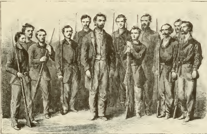
CHAMP FERGUSON AND HIS GUARD.

There is little doubt that Champ Ferguson failed to receive a fair trial in Nashville beginning on July 11, 1865. The three Nashville newspapers, Daily Union , Nashville Dispatch , and the Daily Press and Times were Northern-held, and Ferguson was a Confederate guerilla . Daily, the citizens were fed an emotional diet of lurid stories, vicious attacks, and personal reporter assessments of the killer's war career. The reactions of the citizens and the "reporting" apparently made little impact on Ferguson. There is no shred of evidence that he ever felt any real compunction concerning his actions. The sketches below are from Harper's Weekly (September 23 and November 11, 1865).