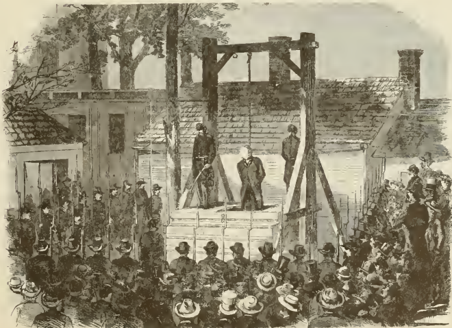
ELECTION OF CHAMP FERGUSON, THE GUERRILLA, AT NASHVILLE, TENNESSEE, OCTOBER 30, 1865.