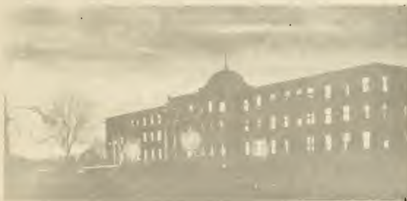
Moon Over T.C. - Almost