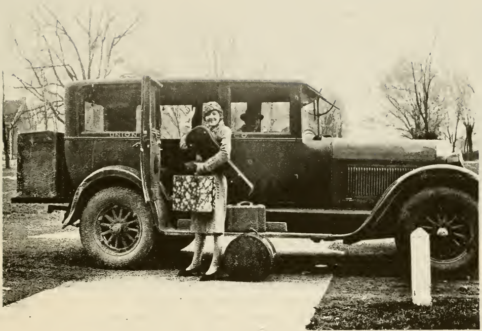
POISED FOR THE TRIP TO THE RAILWAY STATION VIA UNION TAXI COMPANY