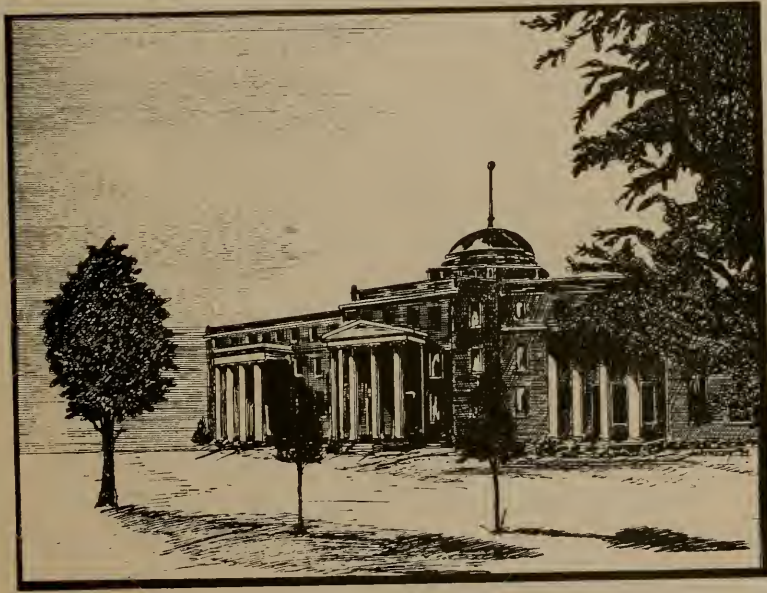
Sketch By Jimmy Mathen