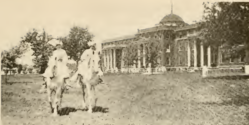
Heralds Leading The Procession At Traditional May Day Pageant - 1914