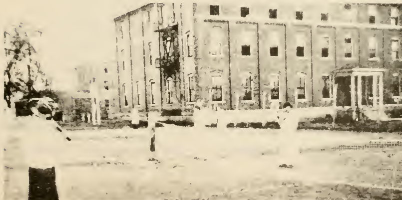
"Action" On The Courts To The Rear Of The Building - 1909