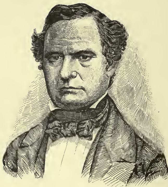
GEORGE D. PRENTICE.