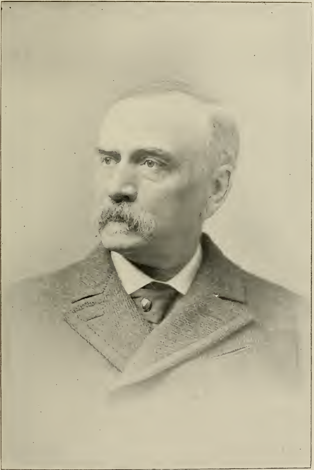
J. STERLING MORTON, 1896.