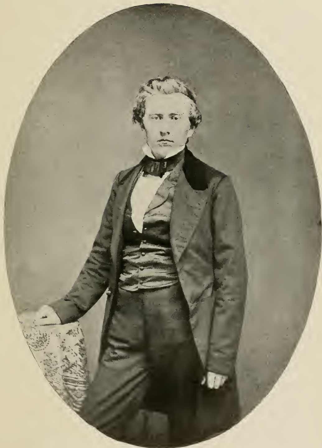
J. STERLING MORTON, 1858.