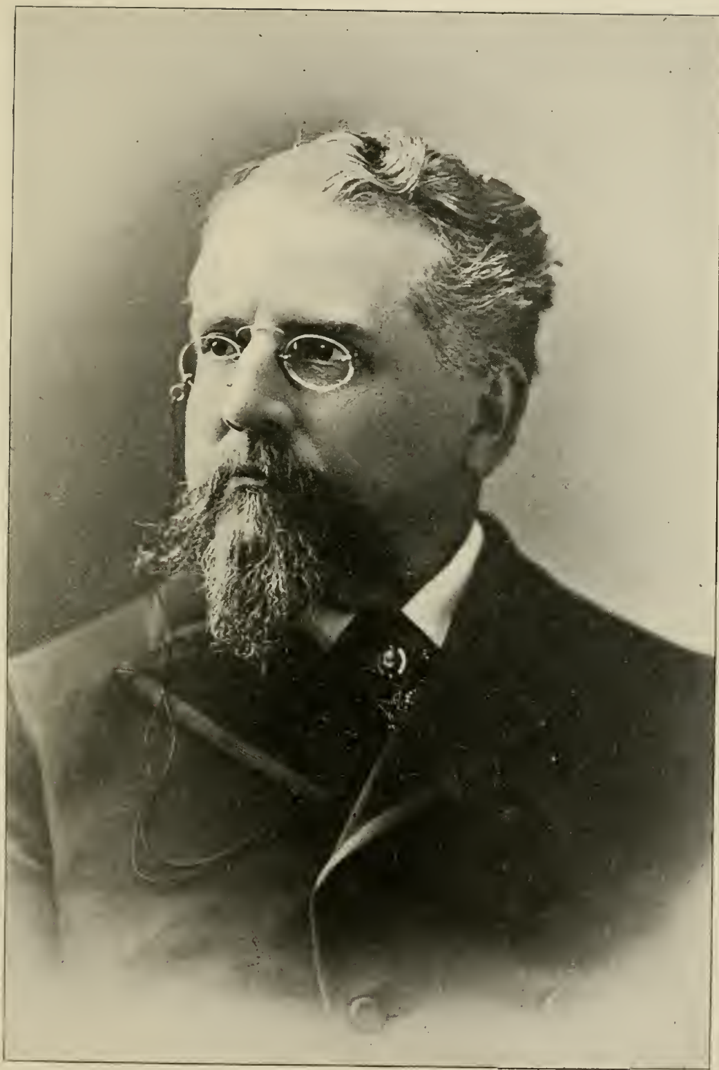
CHAS. F. MANDERSON.