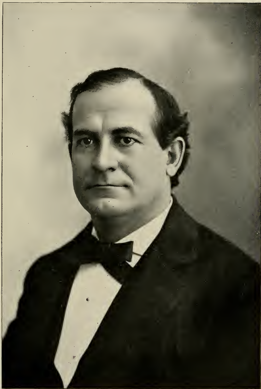
W. J. BRYAN.