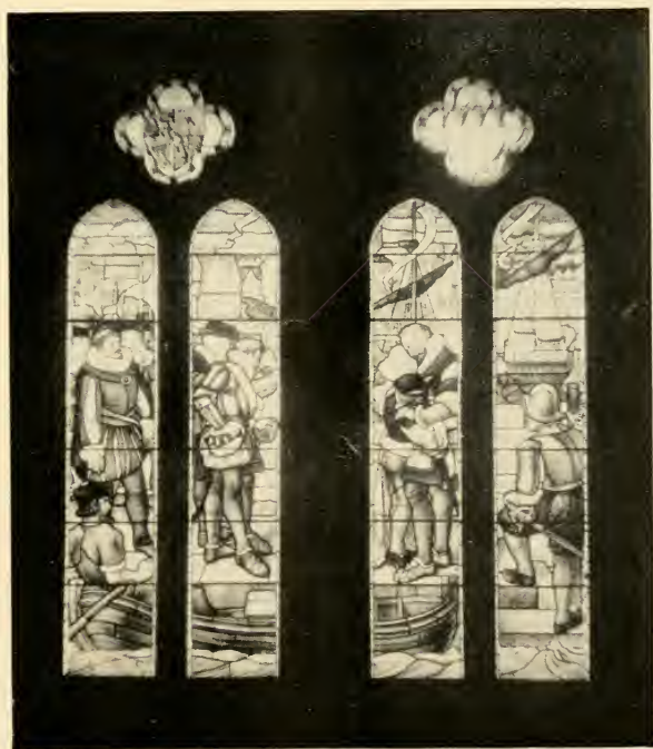
Stained Glass Window, Guildhall, Plymouth.