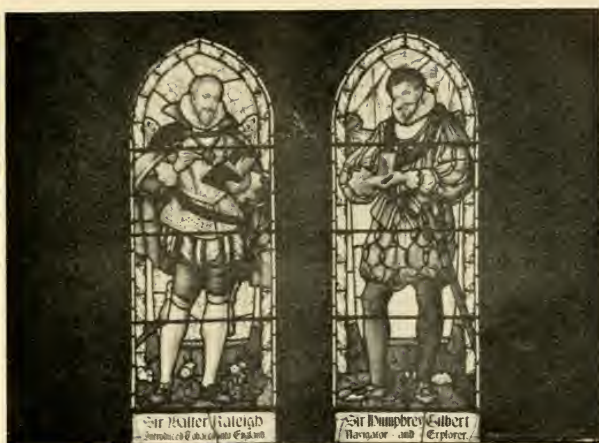
Stained Glass Window, Council Chamber, Plymouth.