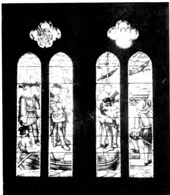
Stained Glass Window, Guildhall, Plymouth.