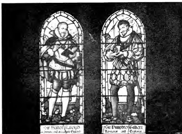
Stained Glass Window, Council Chamber, Plymouth.