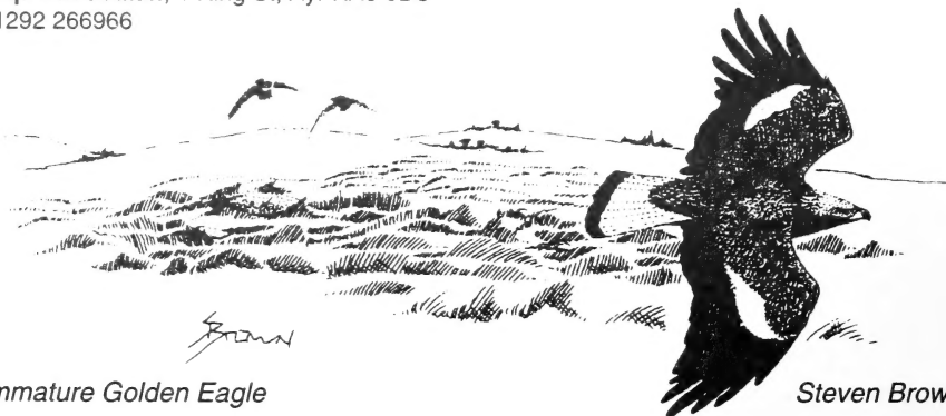
Immature Golden Eagle

PC Dougal Ogilvie , Edzell Police Station, Dunlappie Rd, Edzell Angus DD9 7UB 01356 648222