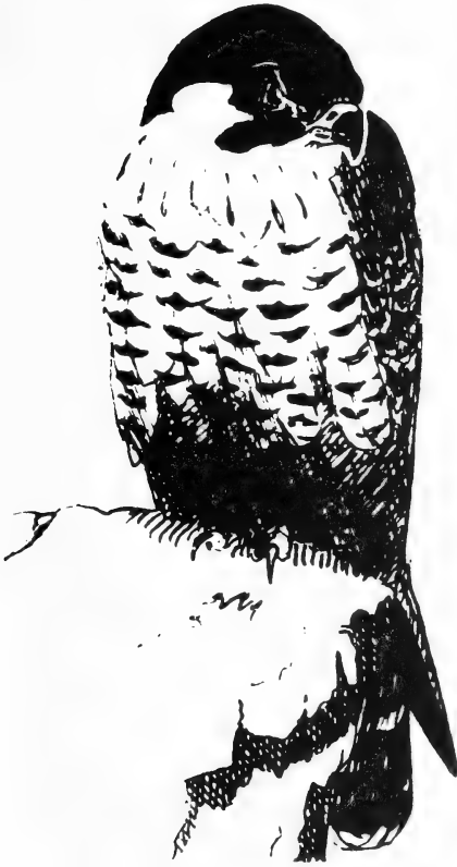
Peregrine Ayrshire Bird Report 1990

interference. Of these 17 pairs, 6 failed at the egg stage, 4 pairs failed at the young stage and 7 pairs failed due to the disappearance of one or other of the adults. A further 12 pairs failed due to natural causes.