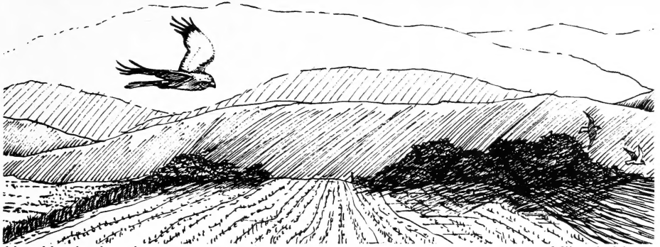
Hen Harrier hunting