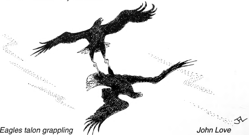
White-tailed Eagles talon grappling

A further 10 birds were brought in from Norway as part of the ongoing release programme. All were successfully released.