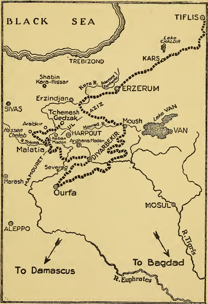
THIS MAP SHOWS AURORA'S WANDERINGS

The black line indicates the route covered by Miss Mardiganian, who during two years walked fourteen hundred miles.