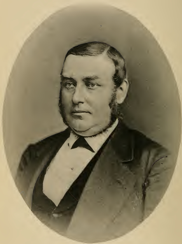
Geo. W. Childs " "