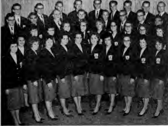
The T.B.C. 40 Voice Chorus, 1963.