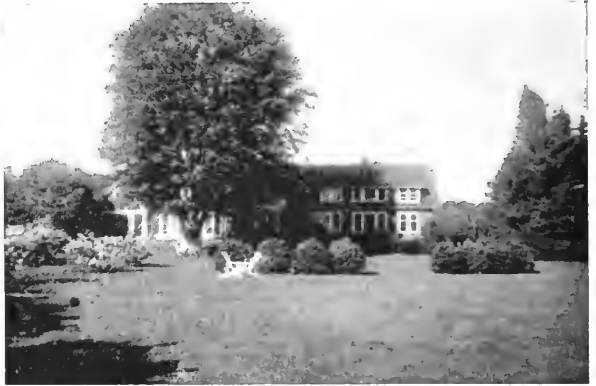
Glen Rocks, The Manor House & Lawn

A year round vacation! Who would not wish for that? This is the happy lot of the group of us who gathered at Glen Rocks beautiful haven of rest. Indeed the actual period was from August 18 to September 3; but the Lord's blessing was so upon us that the physical benefit of that occasion coupled with the renewing of mind and spirit will remain with us till that happy time comes around again.