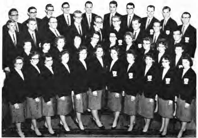
T.B.C. Chorale 1961-62