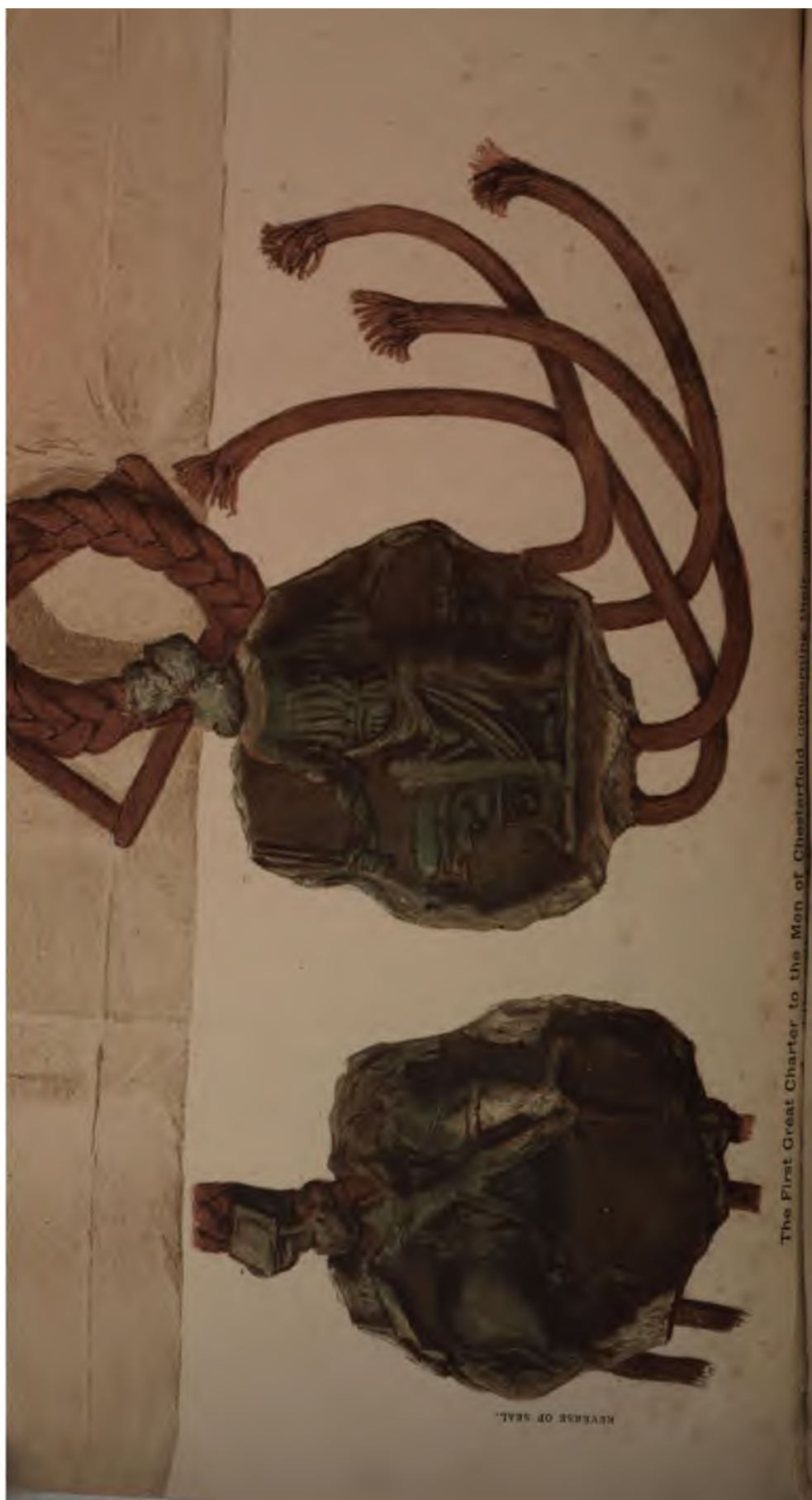
REVERSE OF SEAL.

The First Great Charter to the Men of Chesterfield, containing their