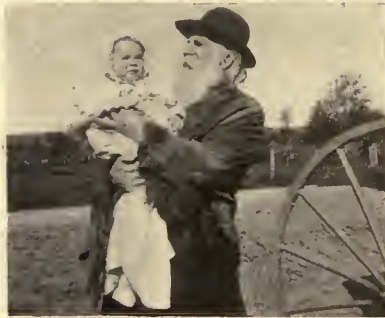
H O M E