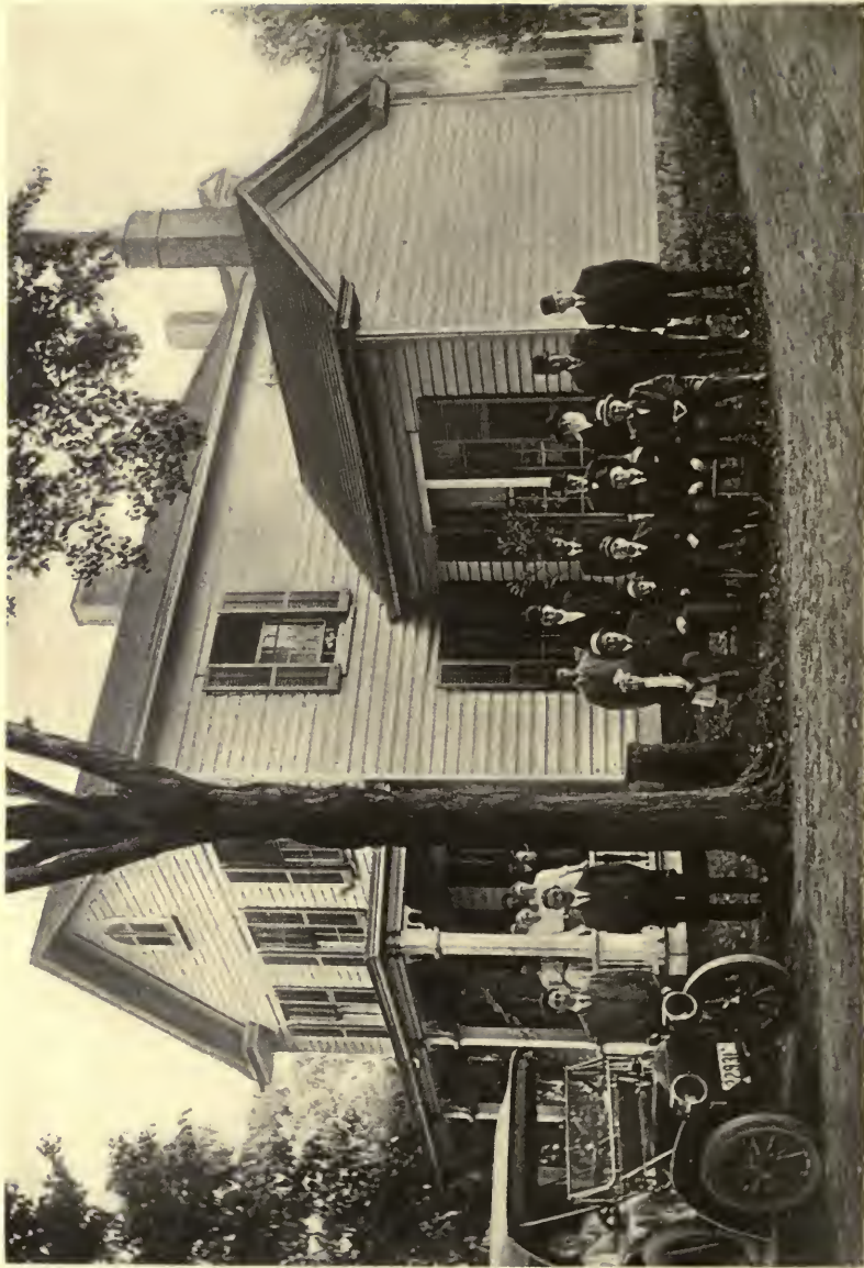
OFFICIAL BOARD WITH THEIR PASTOR