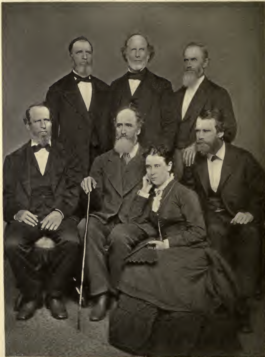
THE STODDARD FAMILY