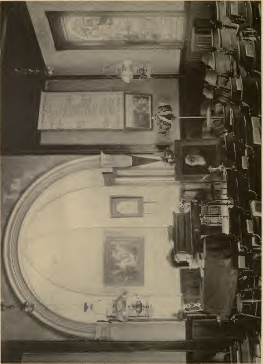
INTERIOR OF CHAPEL