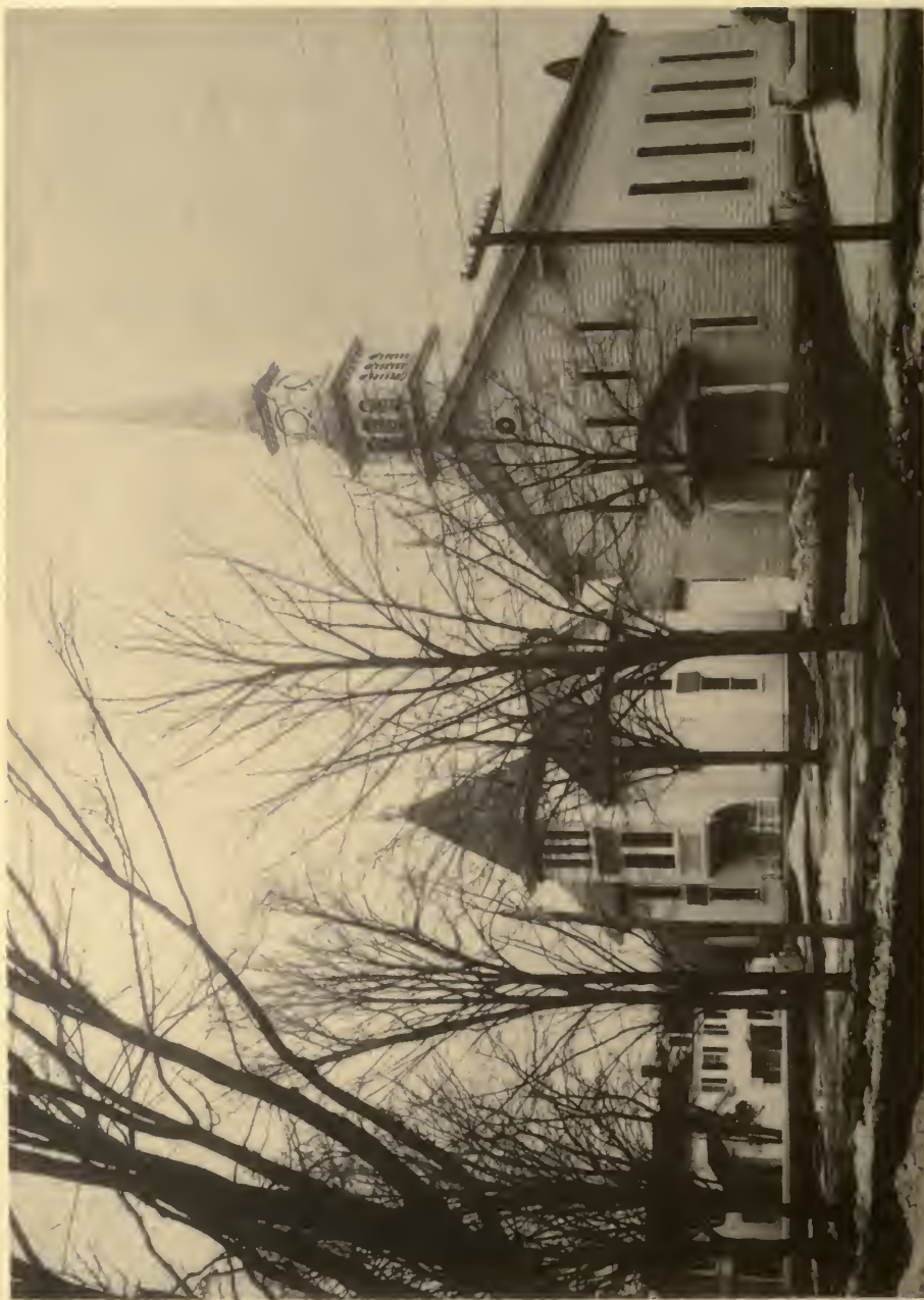
CHURCH CHAPEL AND PARSONAGE AT SUCCASUNNA, N. J.