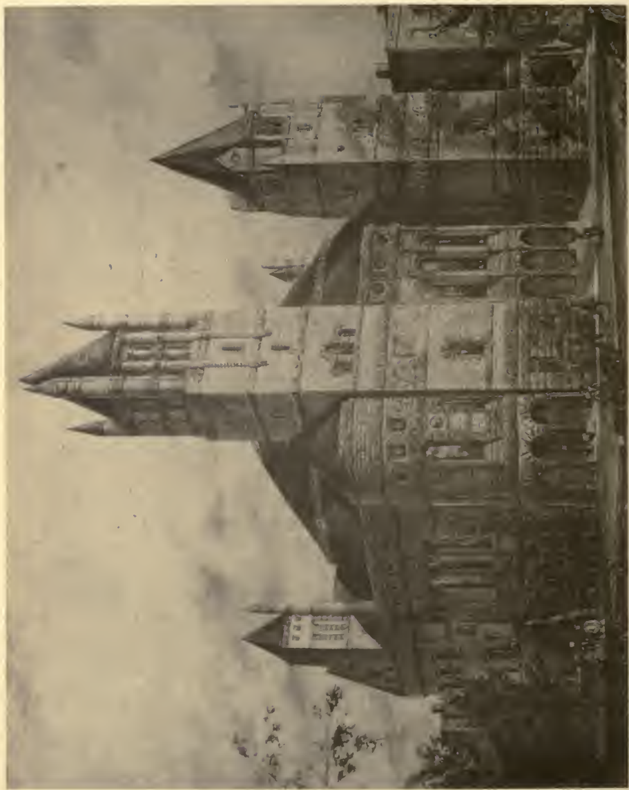
PEDDIE MEMORIAL CHURCH. NEWARK, N. J.