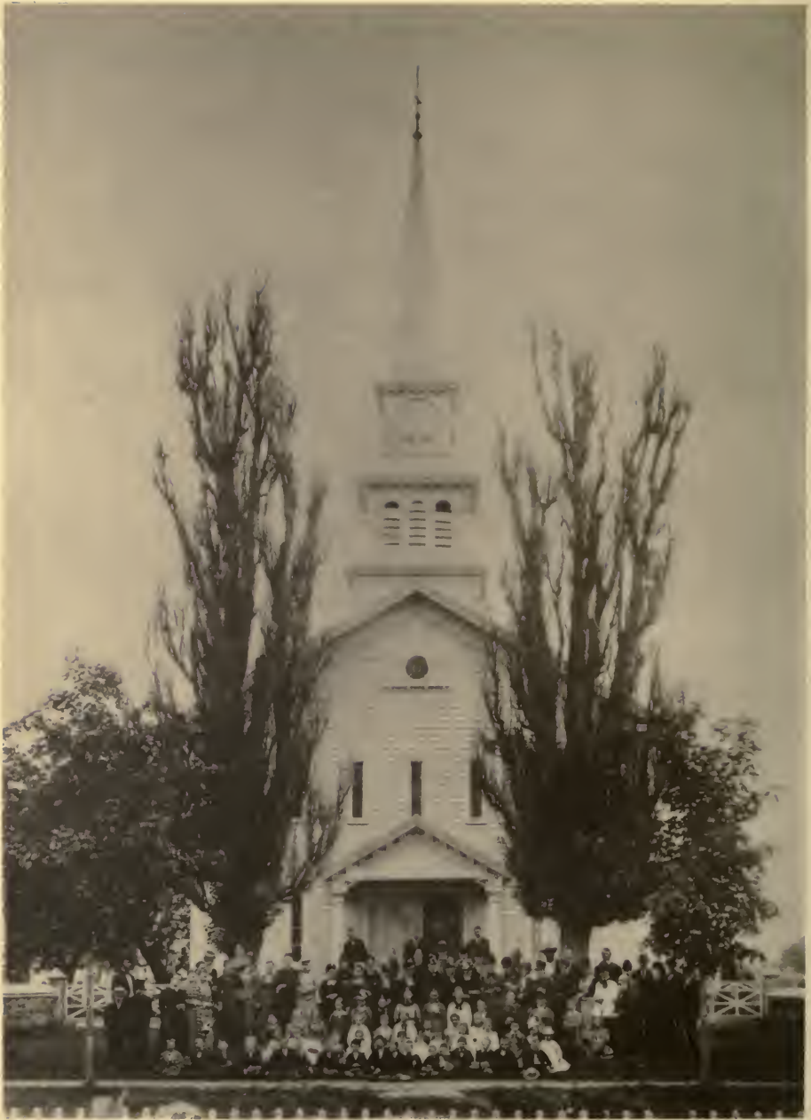
PRESBYTERIAN CHURCH OF SUCCASUNNA WITH THE SUNDAY SCHOOL 1878