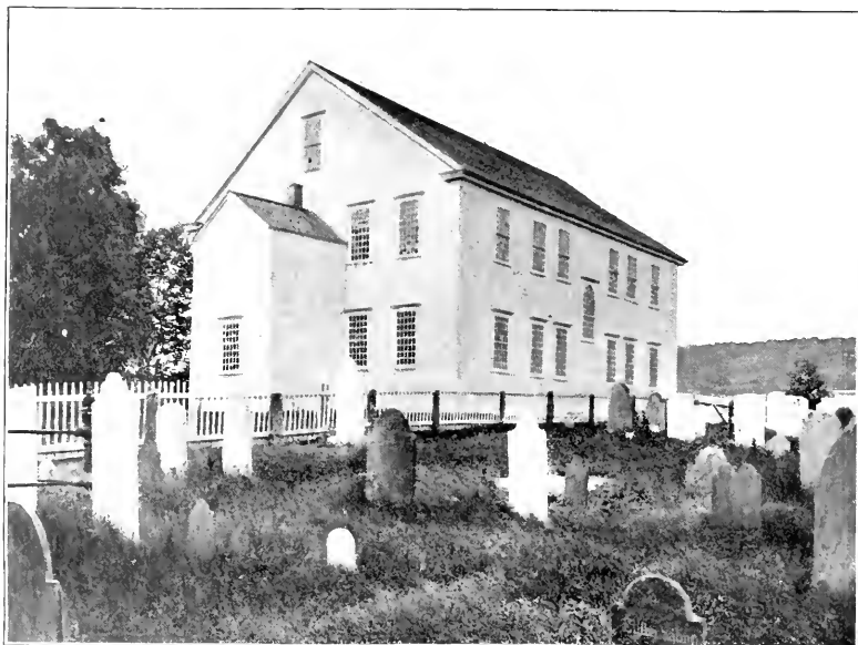
Old Church at Rockingham, Vermont. (Begun 1757.) Exterior.