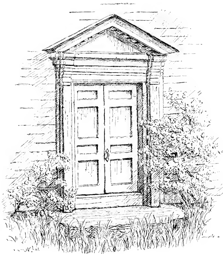
MAIN ENTRANCE OF ROCKINGHAM MEETING HOUSE.