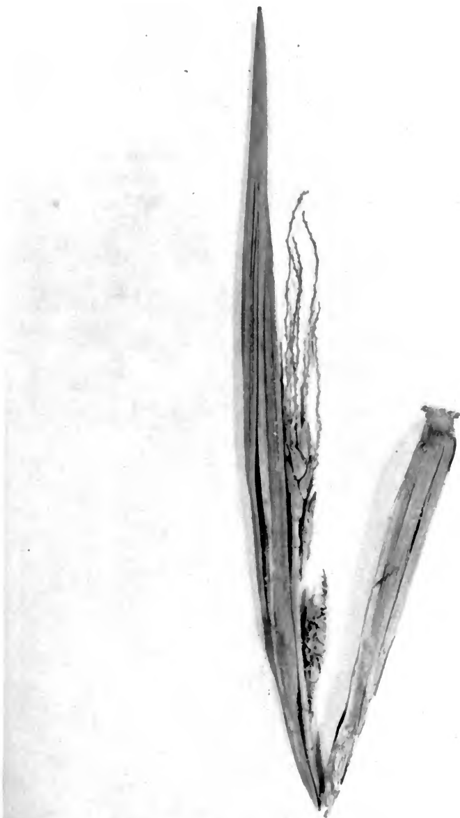
FIG. 9. Syagrus loefgrenii . Spathe and spadix showing short lower branch with small female flowers and longer upper branches with larger female flowers. Kuhlmann 1572 (SP).