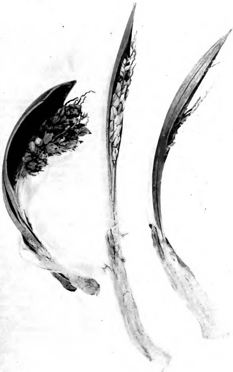
FIG. 11. Syagrus loefgrenii . Three views of spathes and spadices. Left, in fruit; center, mature flowers; right, old spadix with most of the flowers fallen off. Glassman and Gomes 8012 .