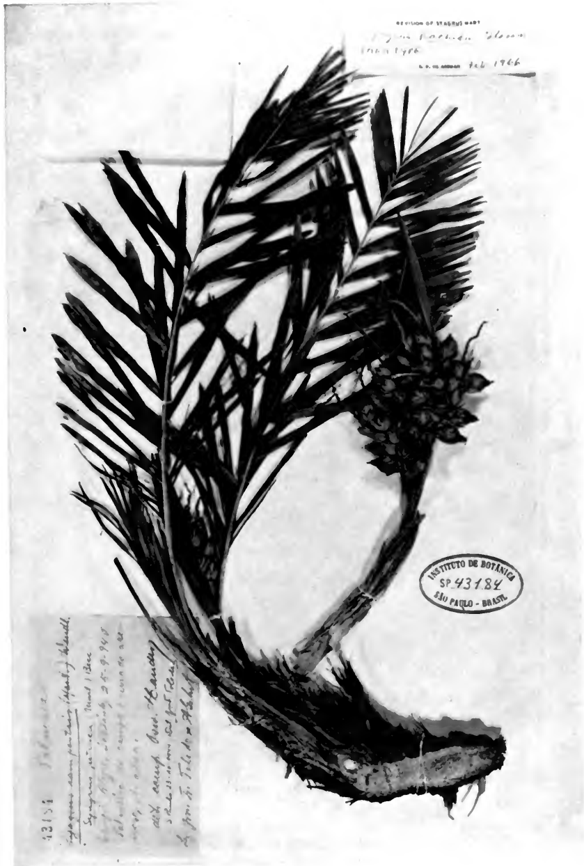
FIG. 3. Syagrus rachidii . Paratype, Toledo and Gehrt 43184 (SP).