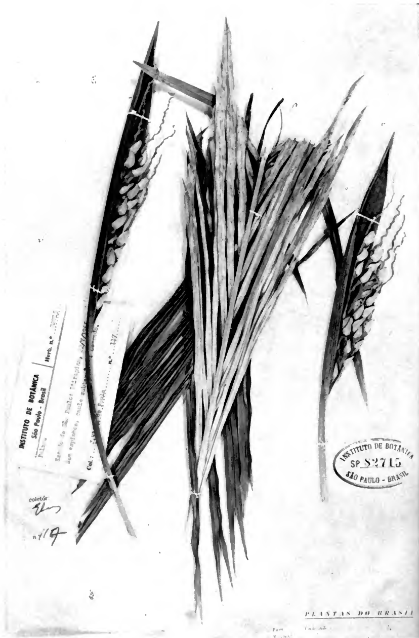
FIG. 8. Syagrus loefgrenii . Part of leaf and two spathes and spadices showing small female flowers. Elias de Paula 117 (SP).