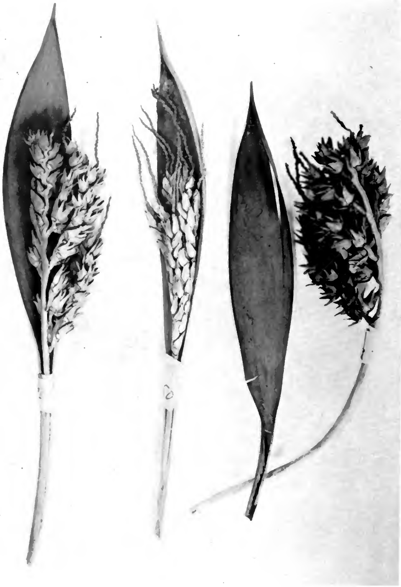
FIG. 4. Syagrus loefgrenii . Three views of spathes and spadices. Left, old flowers setting fruit; center, mature flowers; right, young fruit. Glassman 8750 .