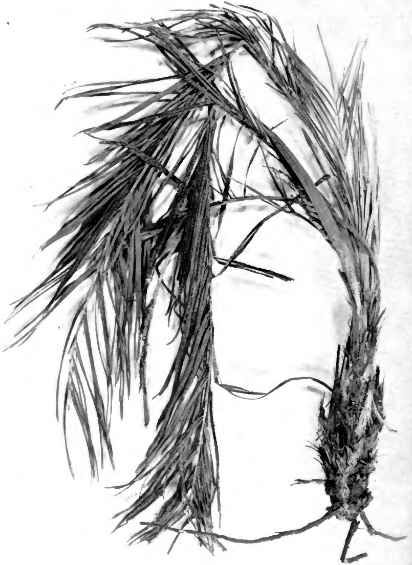
FIG. 10. Syagrus loefgrenii . Whole plant showing subterranean stem, flowering spathe and spadix, and leaves. Glassman and Gomes 8011 .