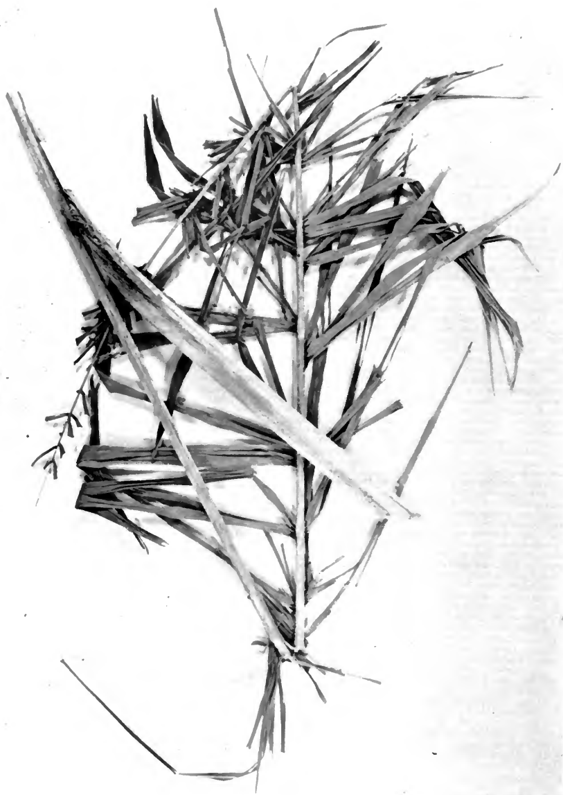
FIG. 6. Syagrus loefgrenii . Whole juvenile leaf showing long sheathing base and petiole. Glassman 8751.