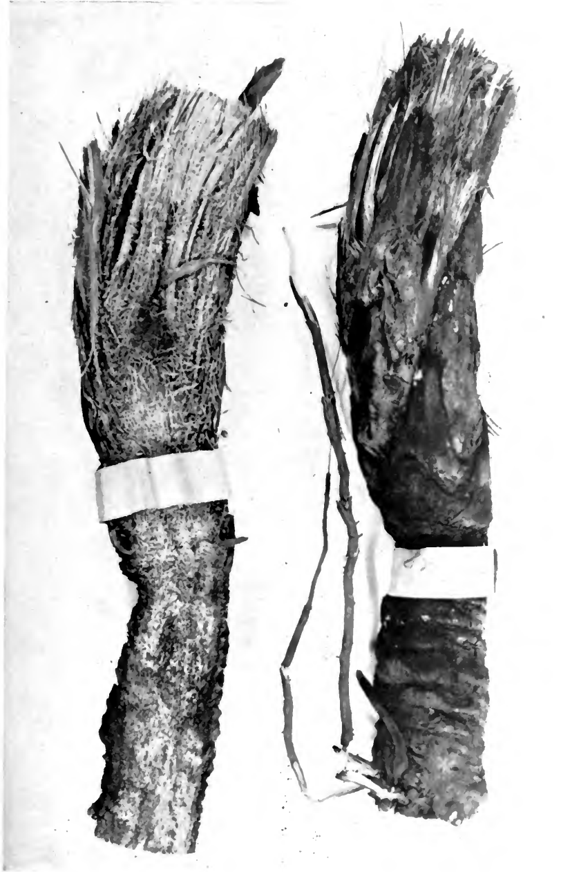
FIG. 7. Syagrus loefgrenii . Longitudinal section and external view of short trunk. Glassman 8749.