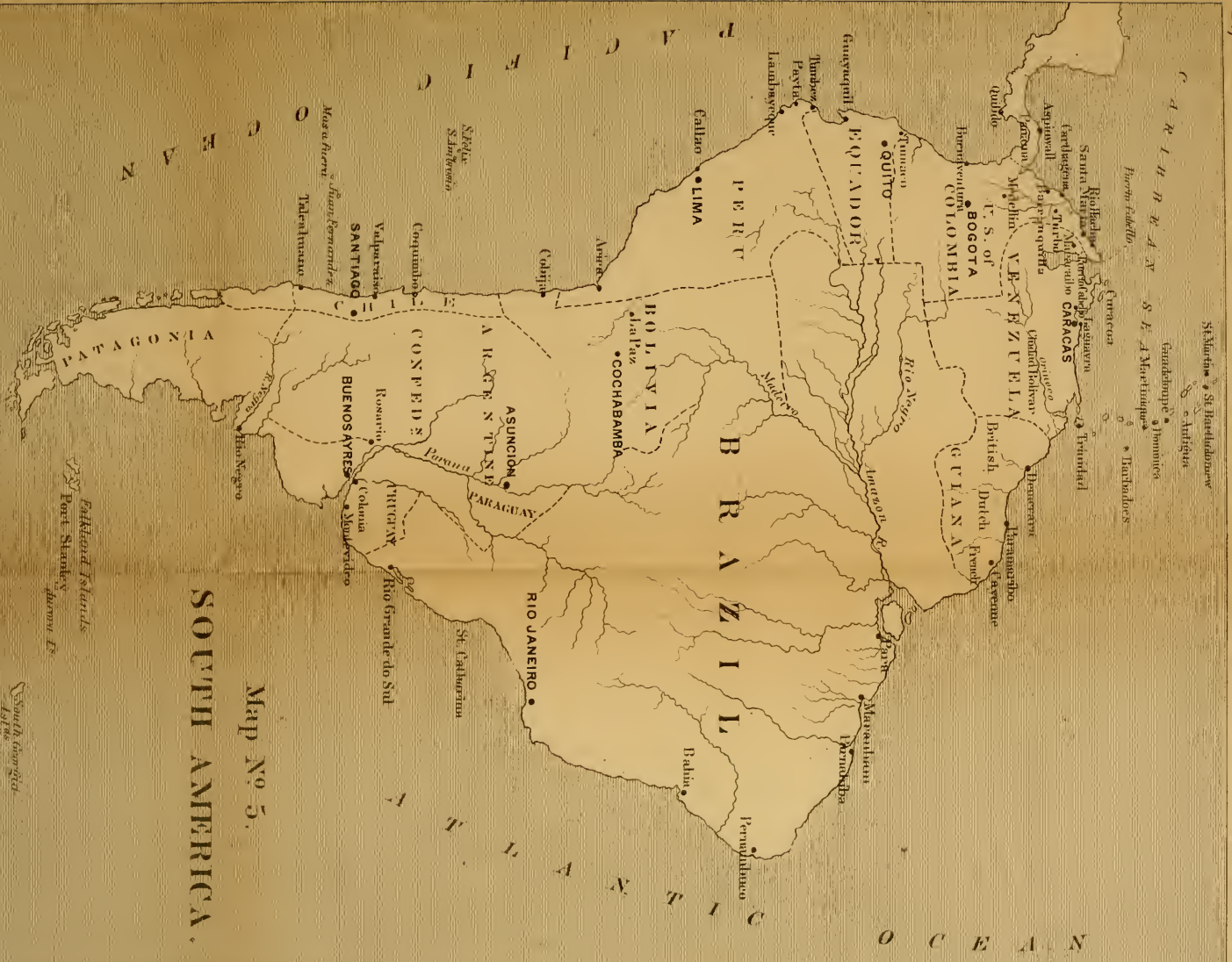
Map No. 5. SOUTH AMERICA.

Diplomatic Posts are written thus RIO JANEIRO Consuls General & Consuls are written thus Bahia.