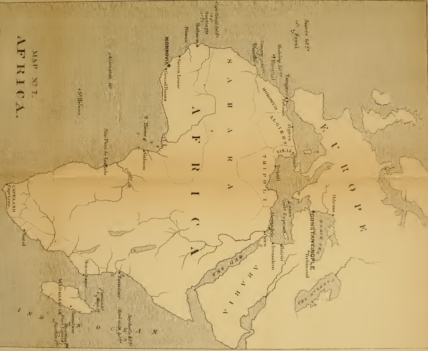
MAP N o 7. AFRICA.

Diplomatic Lists are written thus MONROVIA Consuls General & Consuls are written thus Algiers