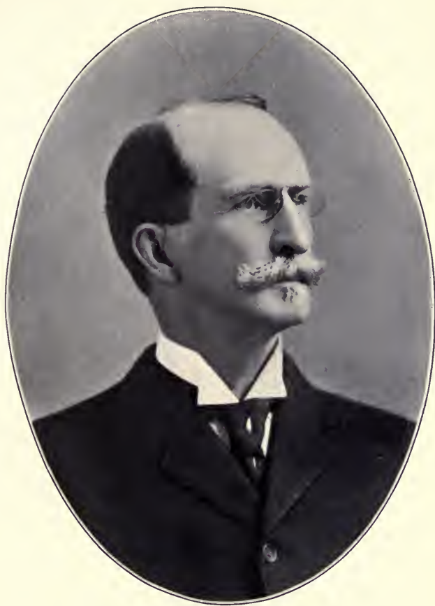
EDWARD MINER GALLAUDET, LL. D. PRESIDENT, 1897-9.