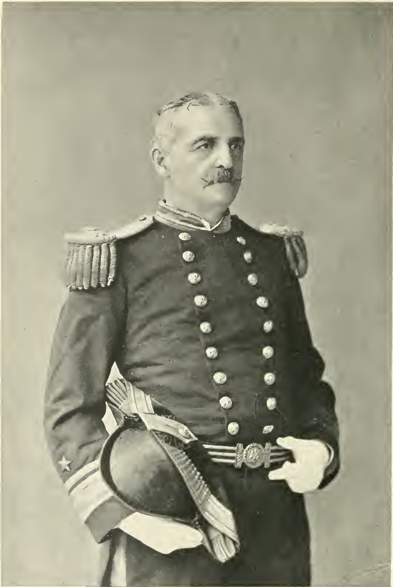
Richard Worsam Meade Rear Admiral U.S. Navy.