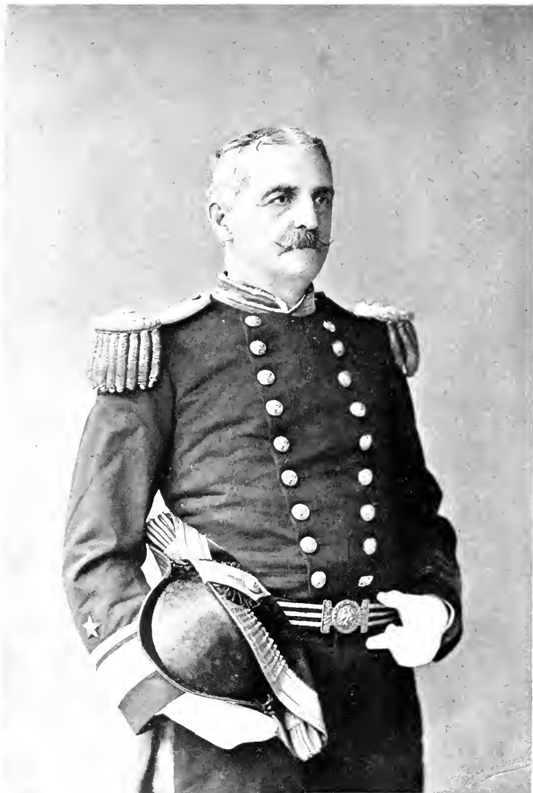
Richard Worsam Meade Rear Admiral U.S. Navy.