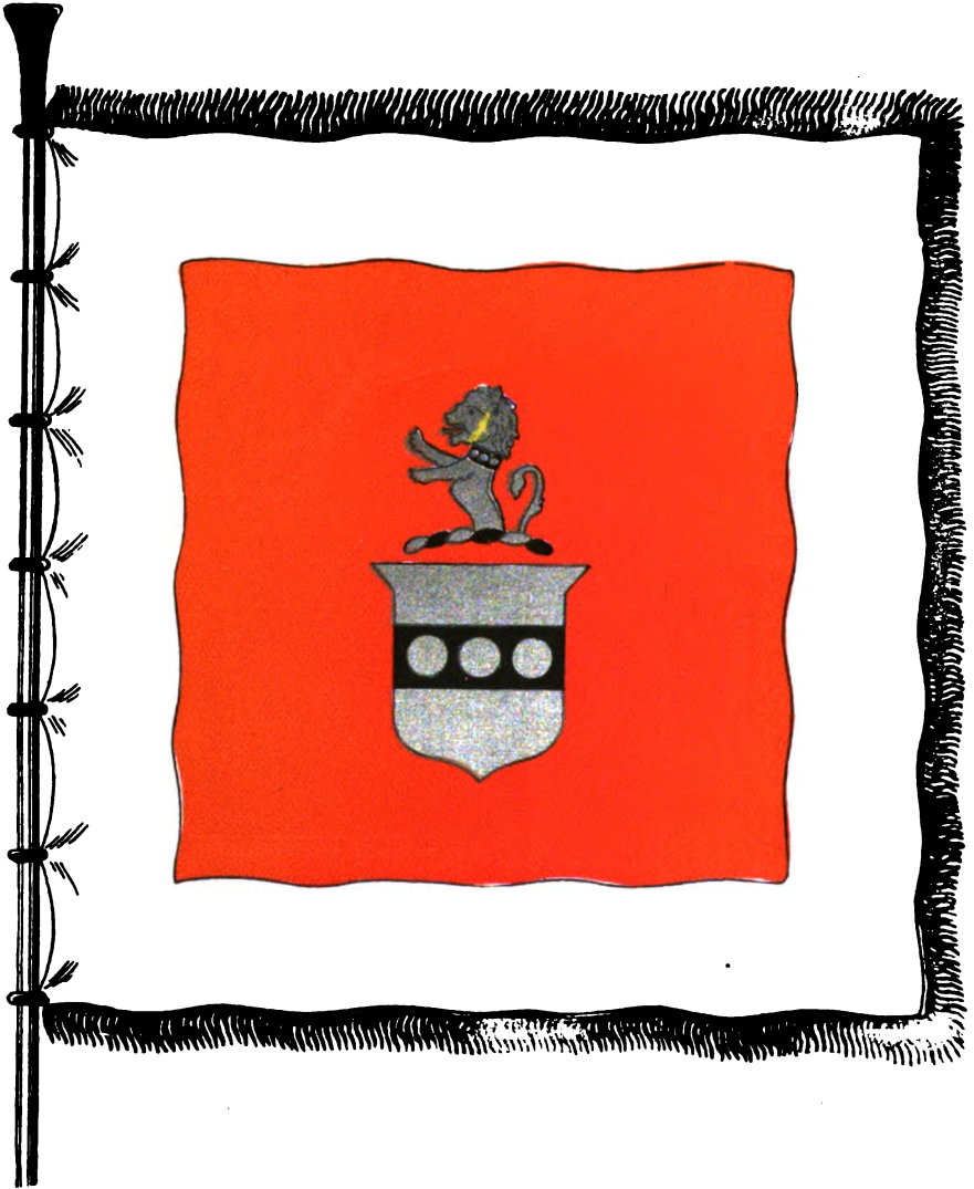
FLAG OF THE PENNSYLVANIA SOCIETY COLONIAL DAMES OF AMERICA.