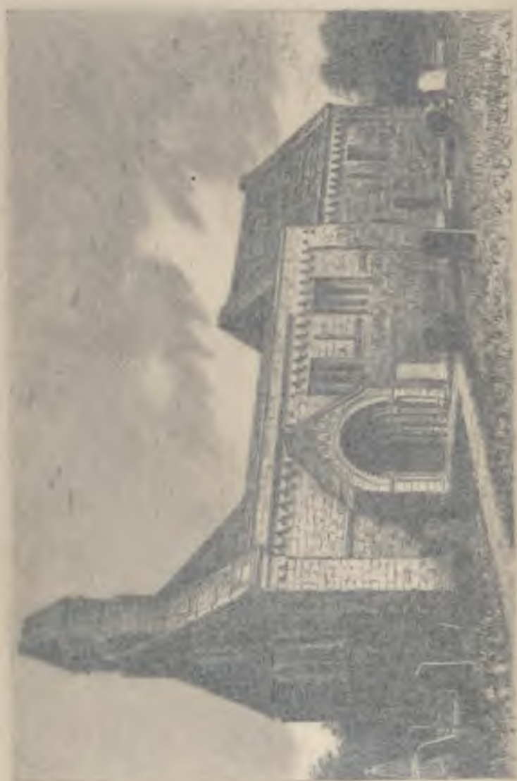
THE GREAT CHURCH - 1841 - 1842