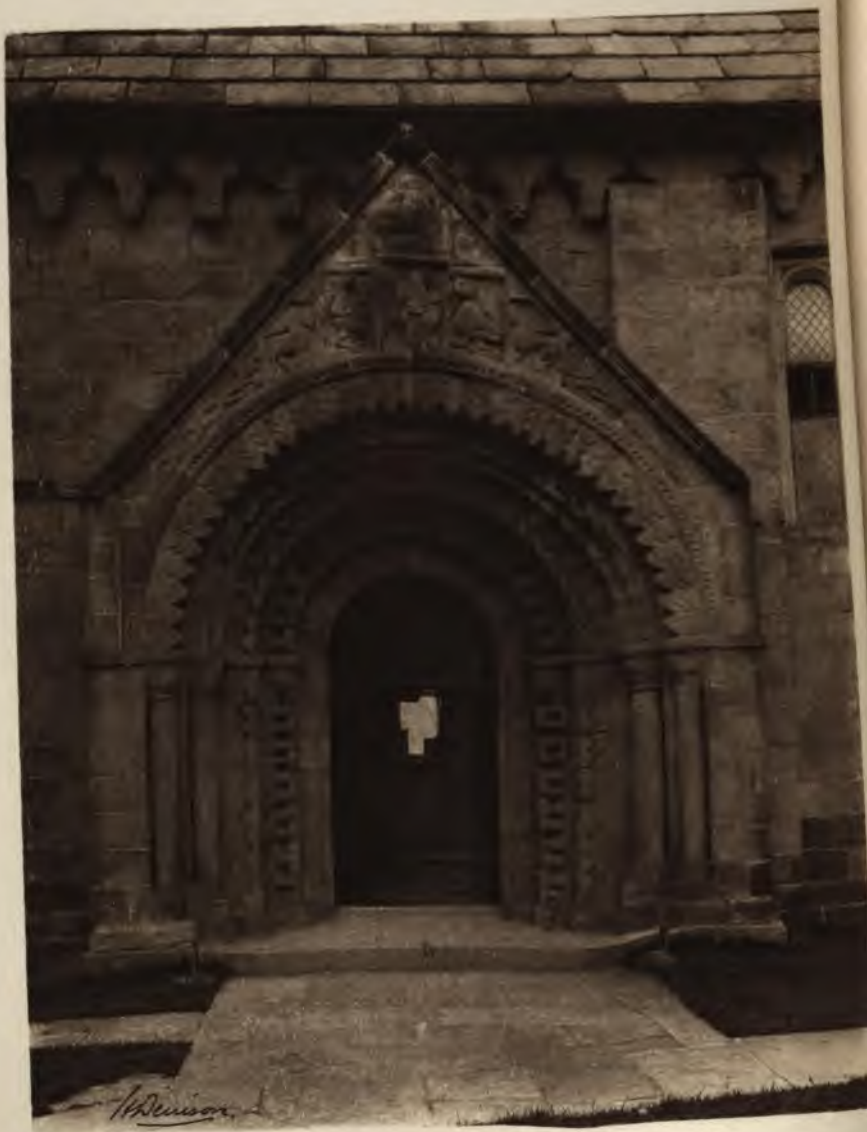
The Porch - Adel Church.