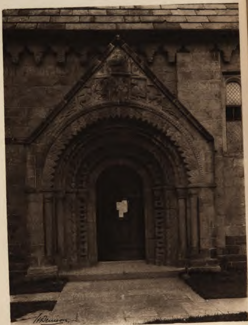
The Porch—Adel Church.