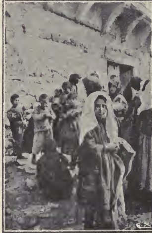
Greek school children at Rodolivos, changing, in the street, their old clothes for the new garments just given them by the American Red Cross.

the mountain and which are caught occasionally by the inhabitants.