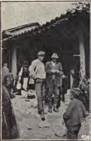
Street scene in Pravi with bazaar in background; showing group of villagers, some in native costume.

Three days later the distributing station at Pravi was opened, similar arrangements having been made there