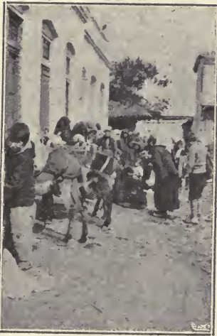
Loading mules at Rodolivos with the gifts of the Red Cross. One little animal carries the burdens of several families.

After adopting this plan, the next step was to procure a list of those to be helped, and the method followed in procuring such a list was somewhat as