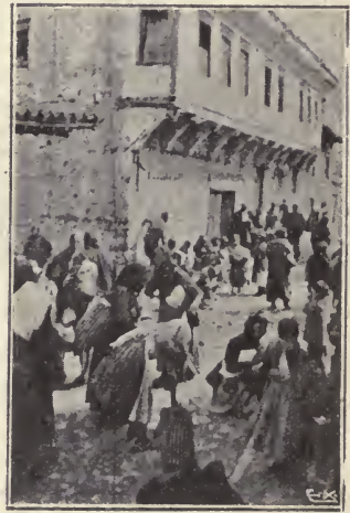
Street scene outside the Red Cross distributing station at Rodolivos. Refugees packing up supplies before starting on the homeward journey.

follows: From our headquarters at the distributing stations the mayors of certain villages were asked to report, at which time they were requested to prepare lists of the most worthy and needy inhabitants of their towns, particularly those who had suffered as a result of the war. Usually the next day these lists were brought to us, and with the mayor and an interpreter each list was gone over and questions asked with reference to each name. Some of these questions no doubt seemed rather person-