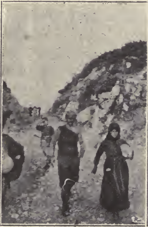
Refugees from Paleochori, returning from Pravi with Red Cross supplies, being obliged to take a five-hour walk each way.

Inasmuch as the number of people to be fed from each station amounted to more than could be handled daily, it was so arranged that rations were issued to the individual towns weekly. This had its advantage in the fact