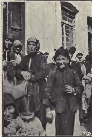
Types of Greek refugees from Kieup-Kioy; awaiting their turn at the distributing station at Rodolivos.