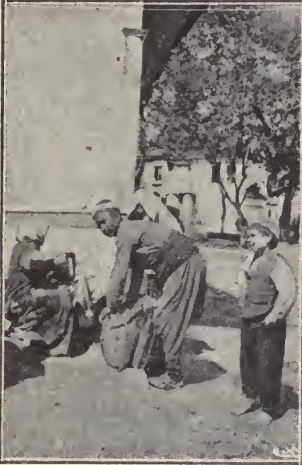
A group of Turks from the devastated Musthenie Valley, ready to carry away their generous share of Red Cross supplies, the whole family assisting.

is filled with a dozen or more species of wild birds, some exquisitely colored, which always proved a source of enjoyment during the long rides around the mountain. This spring the wild flowers were the most beautiful I have ever seen and grew in rank profusion. There are also large numbers of hare, foxes and some boar which infest