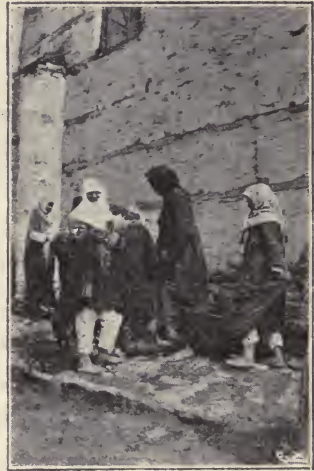
Gypsy women at the Musthenie station; clothed in rags, awaiting a distribution of flannel pajamas—the only available articles of clothing they would wear.

that the recipient of food donations was only obliged to come to the distributing station once a week. Some of the villages are a considerable distance away from the points of distribution, in some cases necessitating a five-hour walk each way.