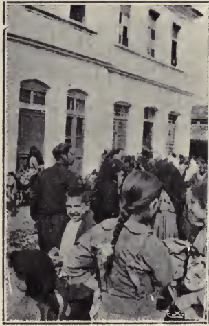
The Line forming for the early morning distribution of food at the Rodolivos magazine.

munication. The roads were narrow and hard to find, and, in a good many places, amounted to nothing more than the beds of running brooks. In crossing the plain of Philippi from Rodolivos to Drama, as was sometimes necessary, the road was completely under water, and in places the horses were forced to swim. Time and again, after half a day's ride, the personnel have come in, soaking wet and covered with mud; but they were always cheerful. To see