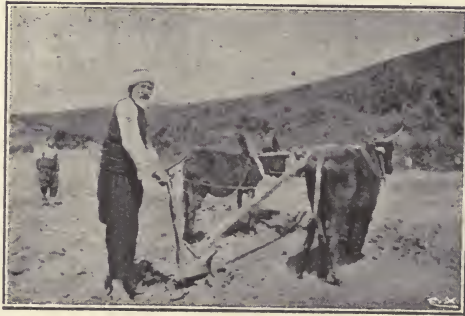
Intensive farming in the Pangaeon. An old Turk of Osmanli with cow and donkey hitched to his home-made wooden plow.

The ox-carts which had carried out the first shipment vanished entirely during the return trip from Kormista. They never appeared again and nothing was ever heard of them. The drivers, it would appear, had come unwillingly, and only waited for an opportunity to disengage themselves from an assignment which was not to their liking. They did not even return for their pay for the one trip they had made.