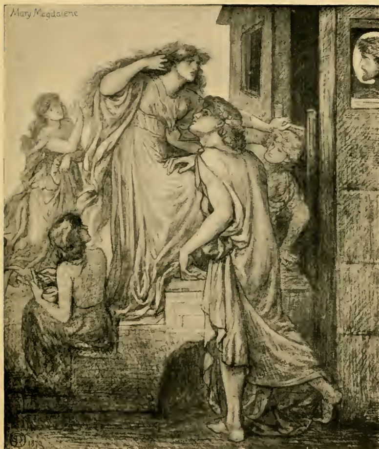
Dante Gabriel Rossetti.