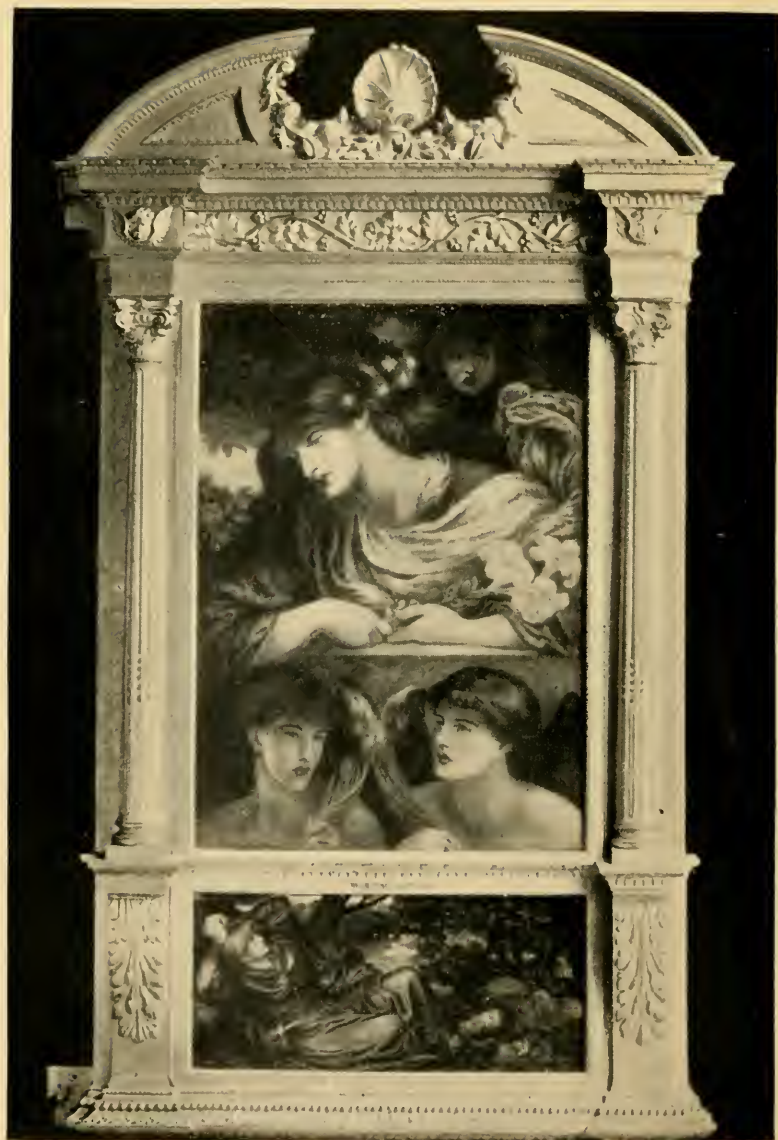
Dante Gabriel Rossetti.