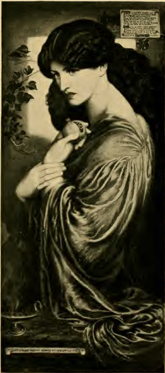
Dante Gabriel Rossetti.