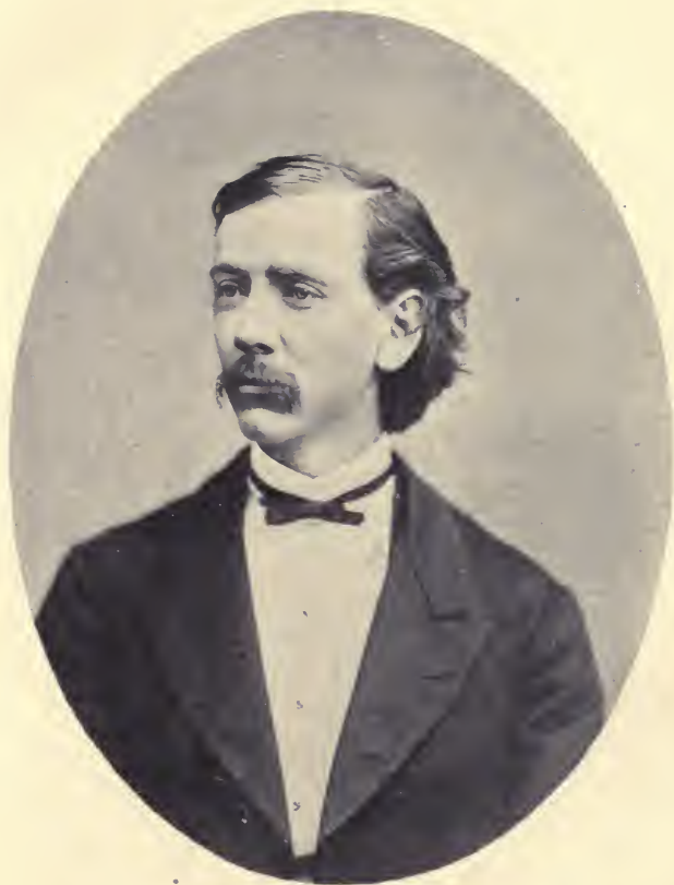
COL. WILLIAM THOMPSON

From a photograph at the close of the Modoc war