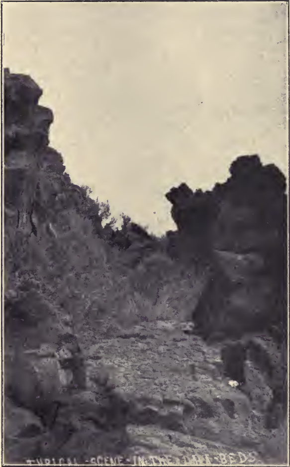
TYPICAL SCENE IN THE LAVA BEDS