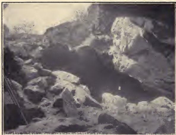
CAPTAIN JACK'S CAVE IN THE LAVA BED STRONGHOLD