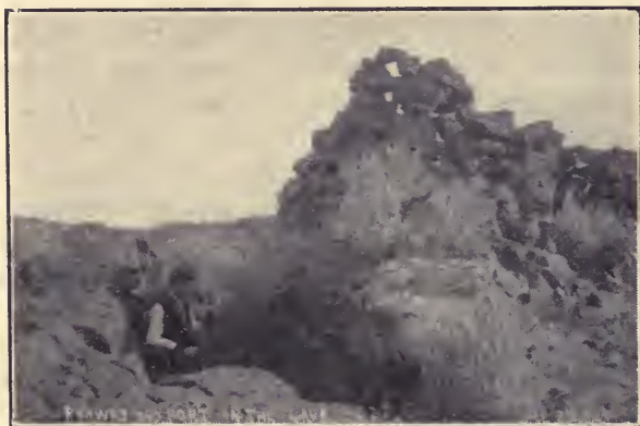
RUNWAY AND FORT IN THE LAVA BEDS