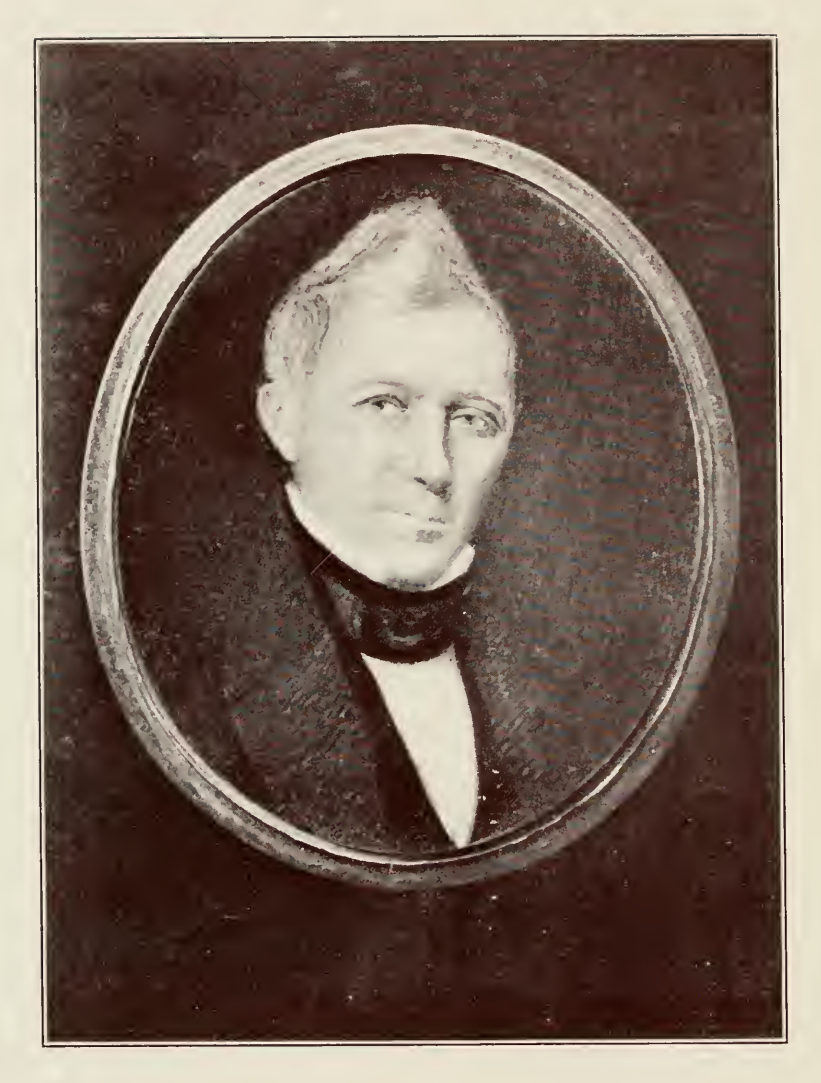
WILSON LUMPKIN TAKEN FROM A MINIATURE, PAINTED WHILE UNITED STATES SENATOR WASHINGTON, 1838.