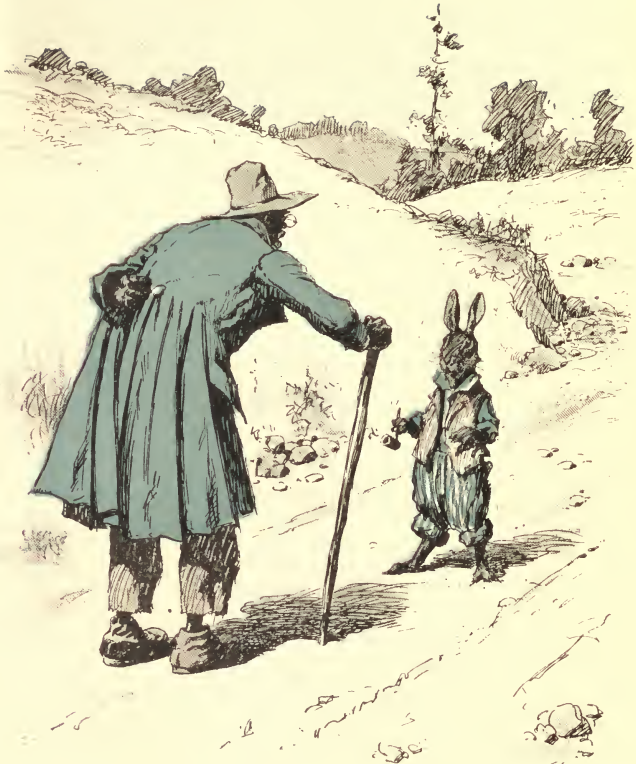
Drawn by A. B. Frost.