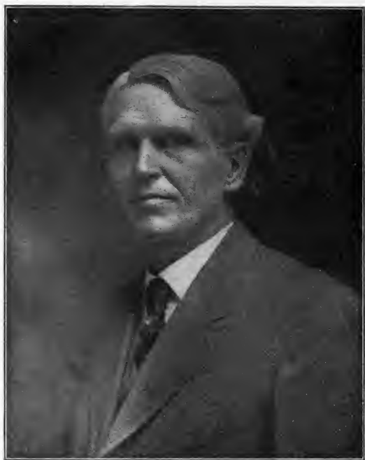
Woodbridge M. Ferris