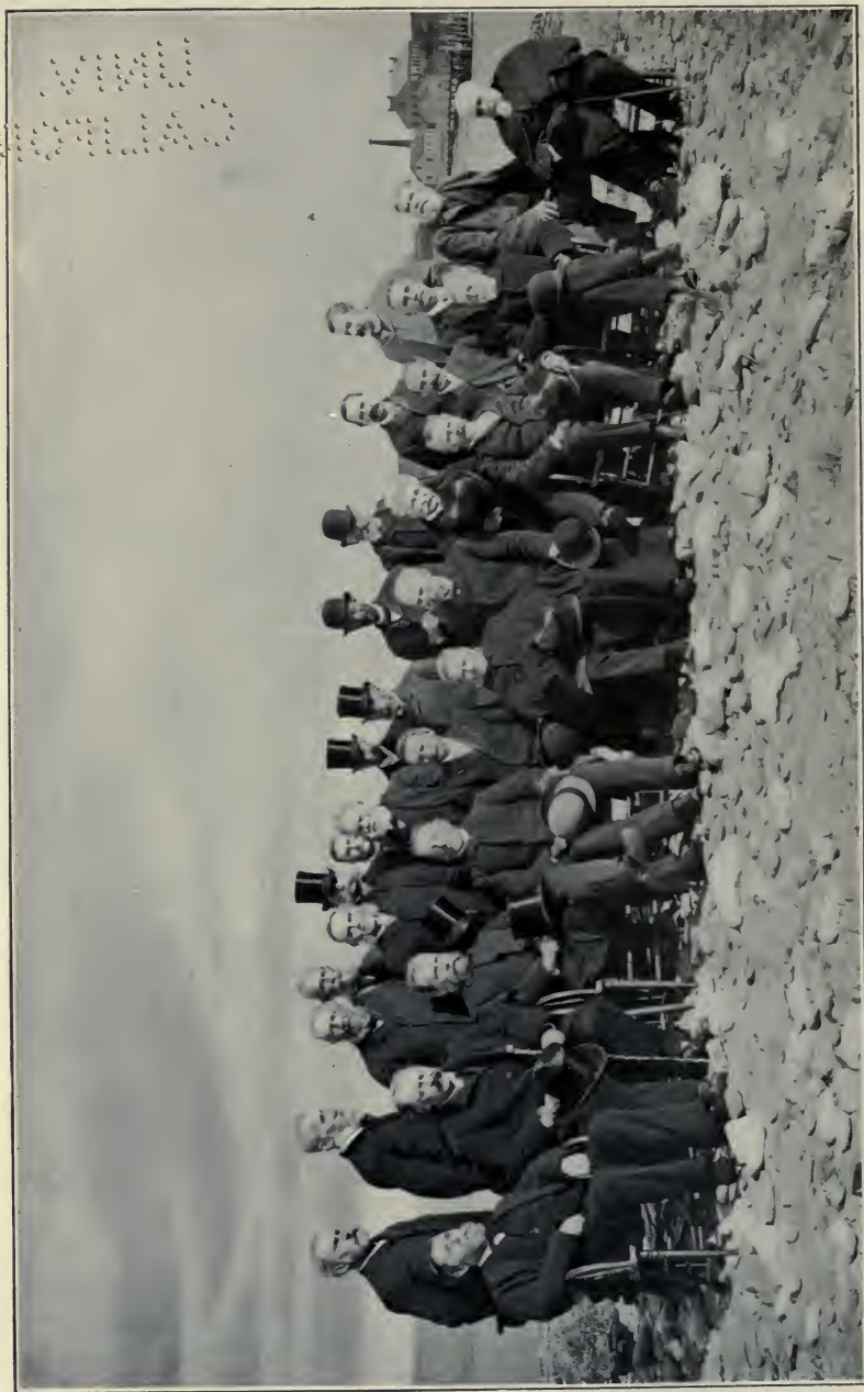
CLARK'S POINT SHIRLEY DINNER, OCTOBER 2, 1889