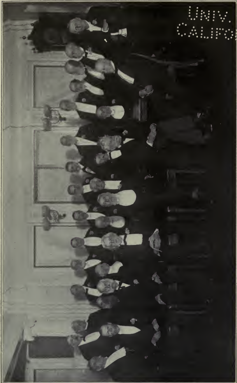
CLARK'S UNION CLUB DINNER, JUNE 23, 1903