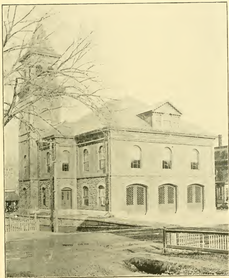
AMHERST STREET FIRE STATION.