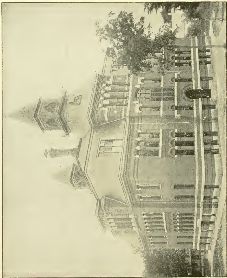
HIGH SCHOOL BUILDING.