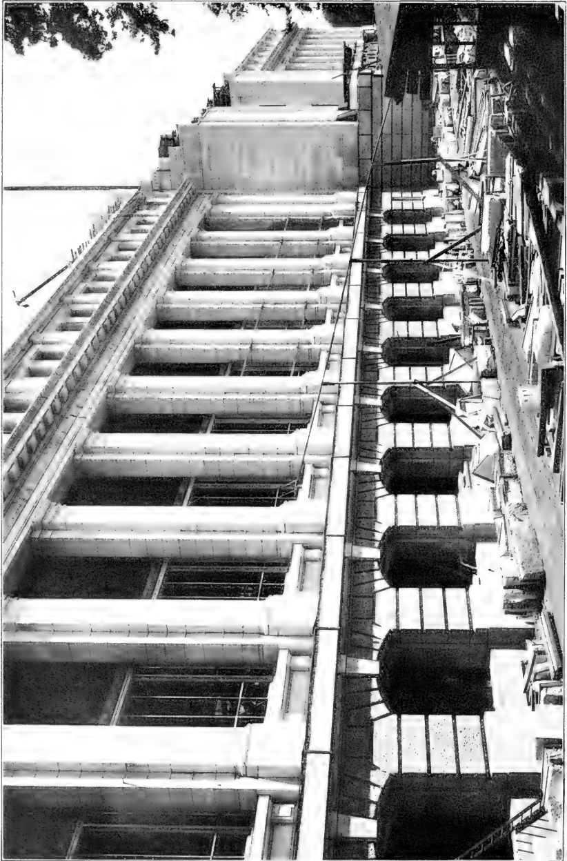
NEW BUILDING FOR UNITED STATES NATIONAL MUSEUM. SOUTH OR MAIN FRONT, SHOWING PROGRESS OF WORK, JULY 8, 1908.