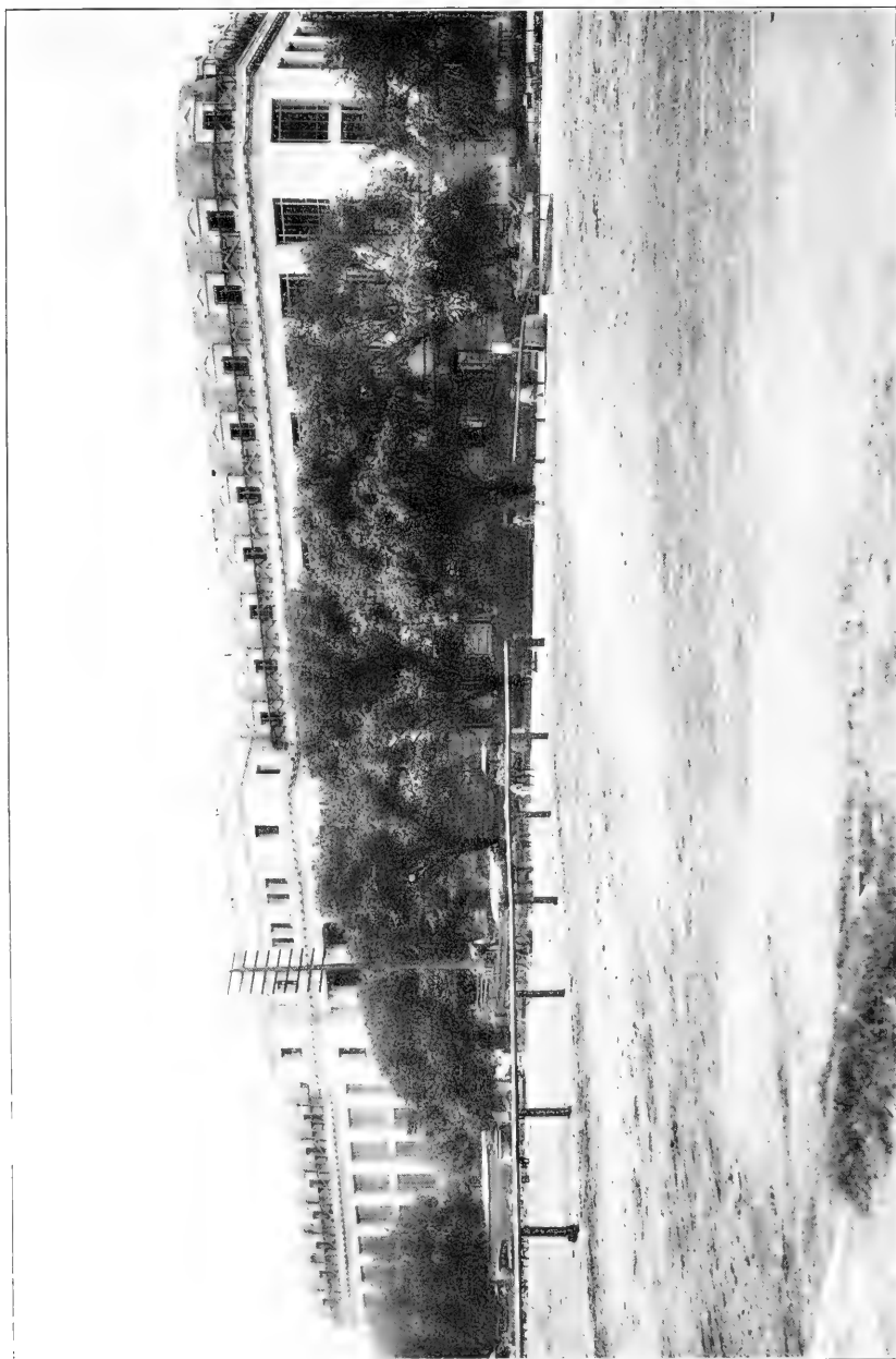
NEW BUILDING FOR UNITED STATES NATIONAL MUSEUM. NORTH FRONT, SHOWING PROGRESS OF WORK, JULY 8, 1908.