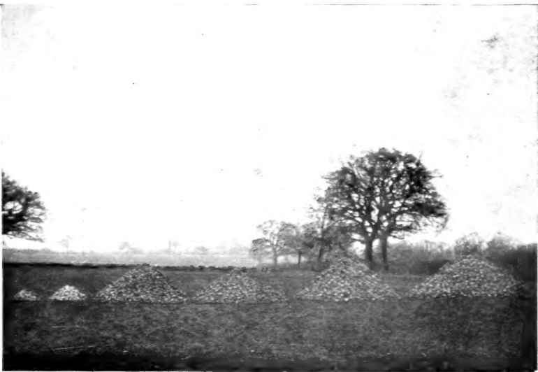
Plots 6 5 4 3 2 1

On the Agdell Field the 16th four-course rotation began with a crop of Swede Turnips, sown on the 12th of June. A very regular plant was obtained, which made good growth throughout the season and showed several interesting features, illustrated by the following photograph taken of the entire crop from each plot.