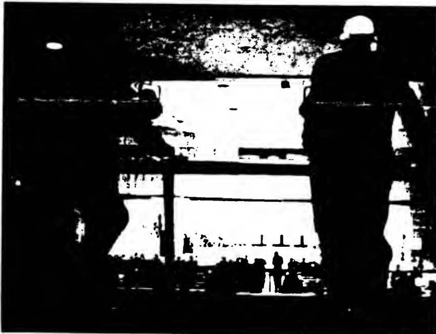
Members listen to the marketing presentation.

unions and the management of the motion picture industry for a tax reform program. In a month of unprecedented hearings, every segment of the national economy was represented before that committee and every representative demanded tax reform. Eighty-five per cent of those testifying asked the committee to bring forth one particular bill which three years later is still buried in the committee. It would seem pressure