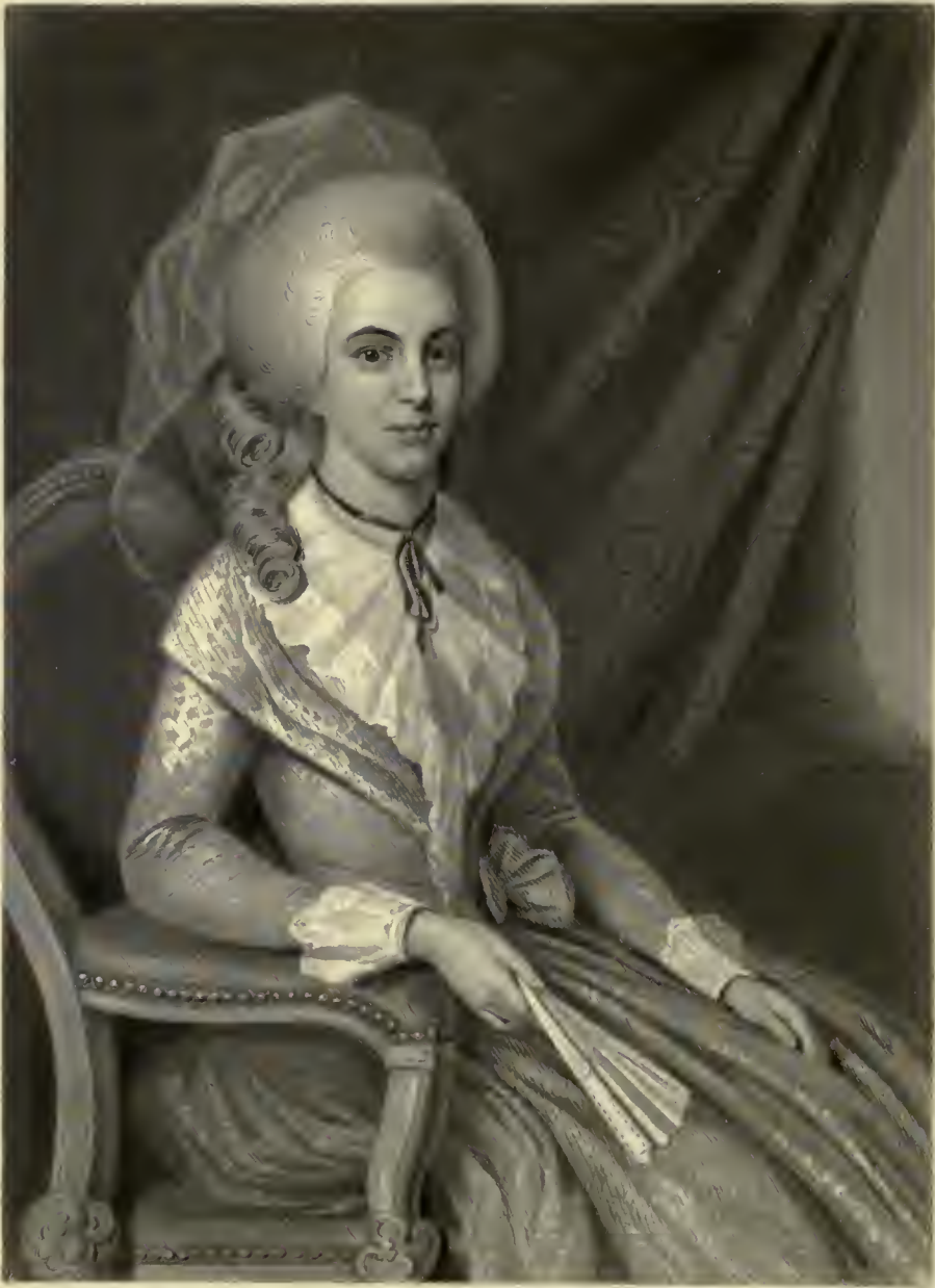
MRS. ALEXANDER HAMILTON.