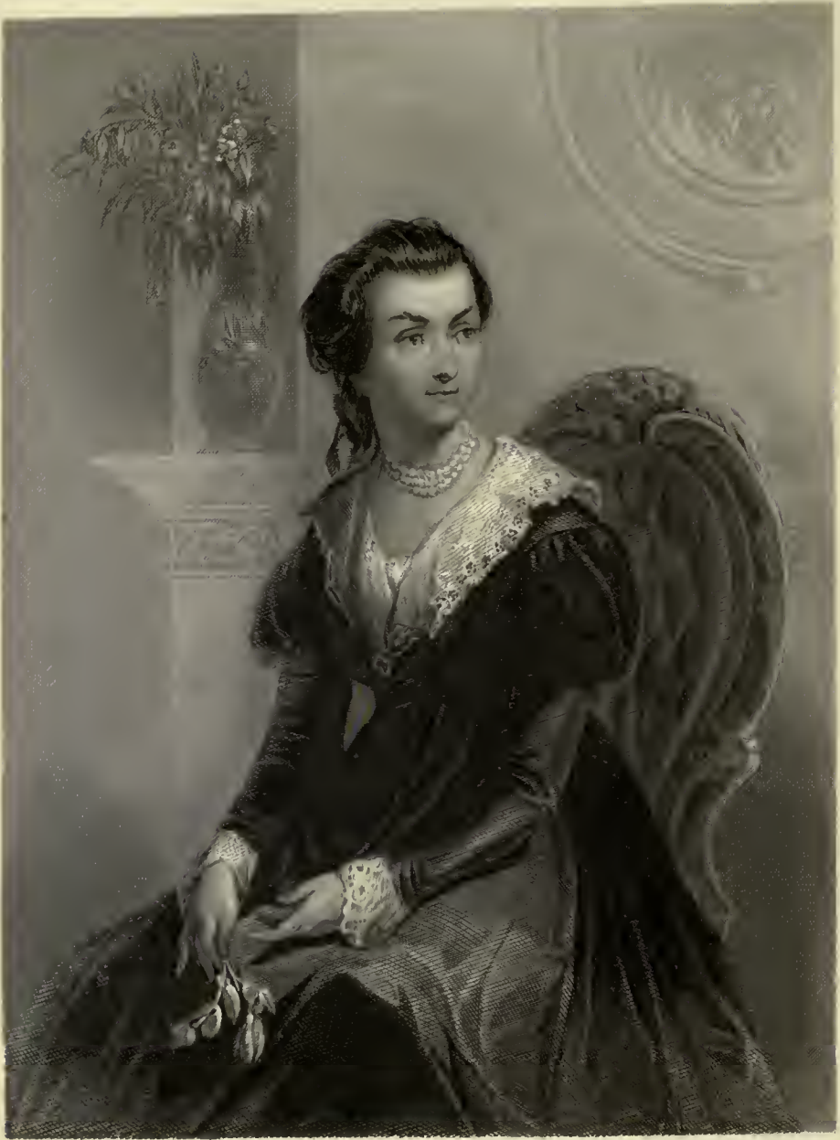
MRS. JOHN ADAMS,