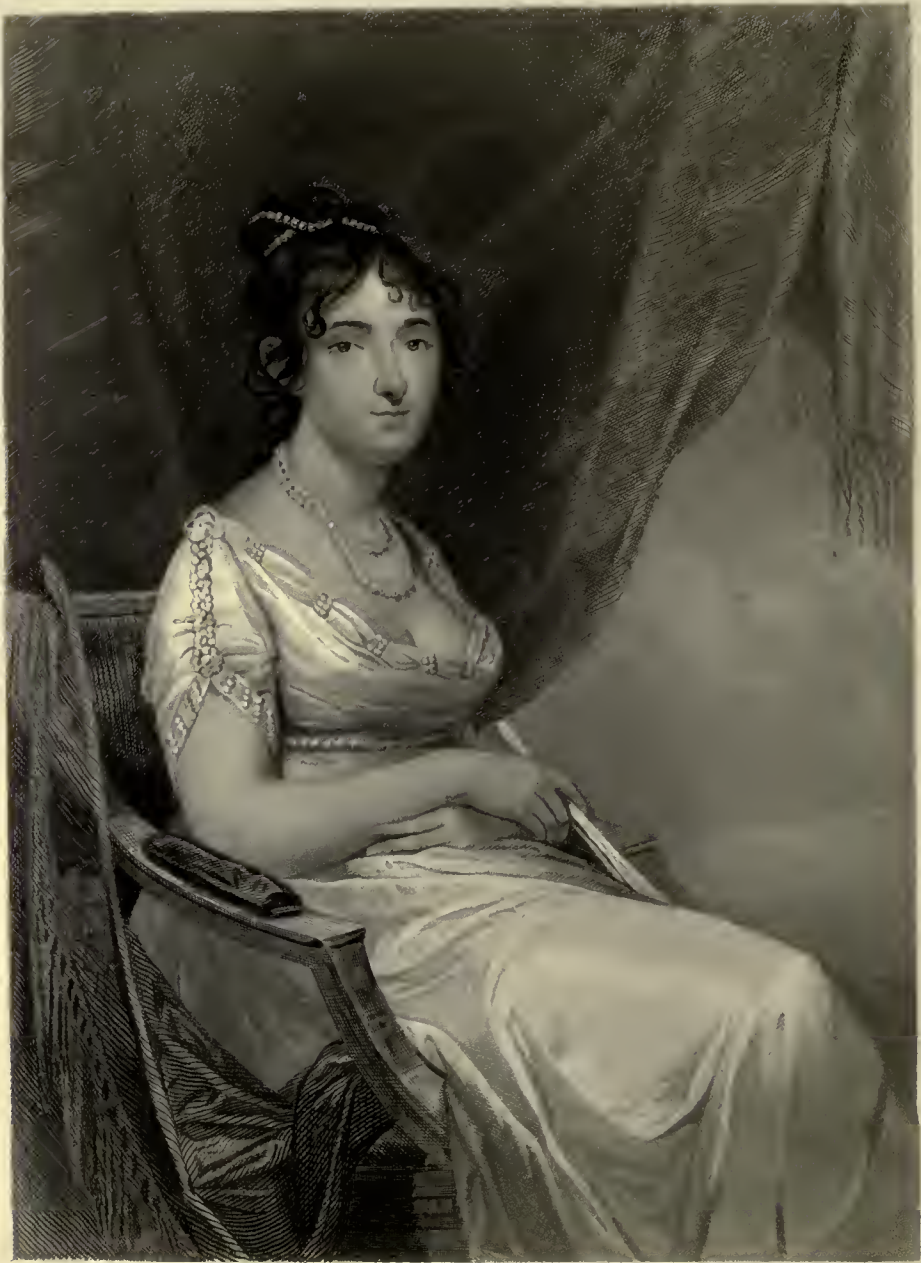
THE MARCHIONESS D'YRUJO,