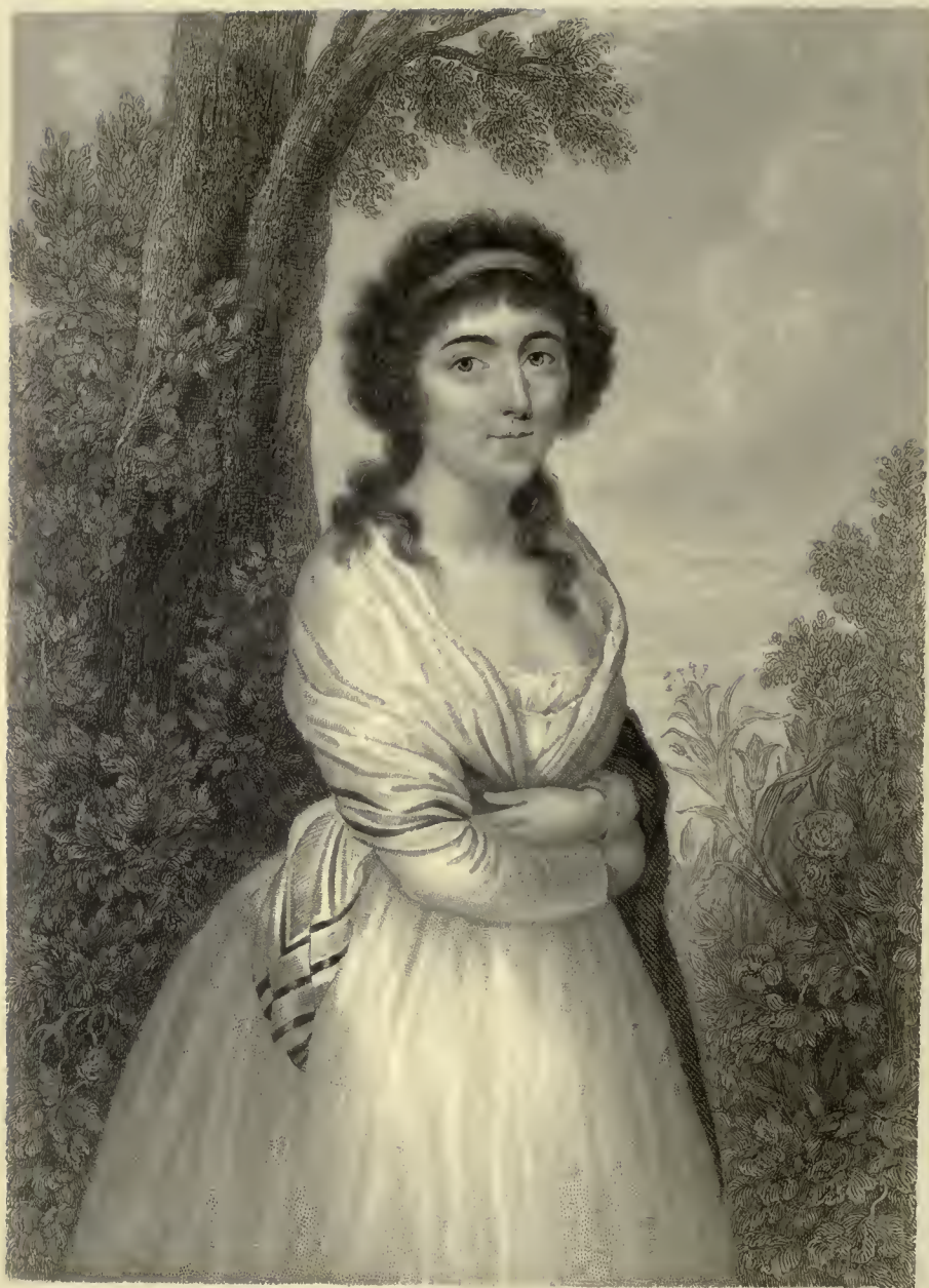
MAD E GENET.