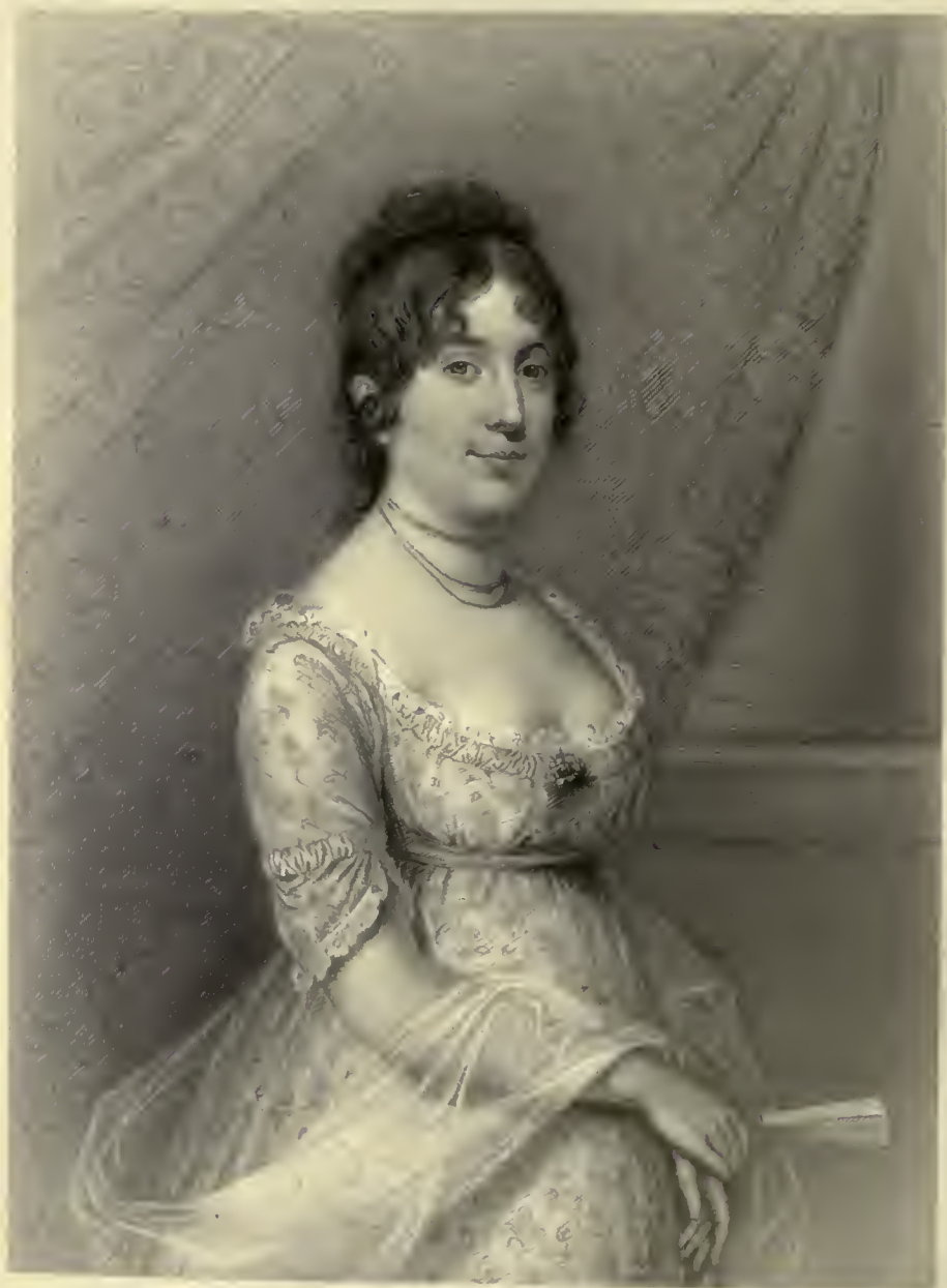
MRS. JAMES MADISON,